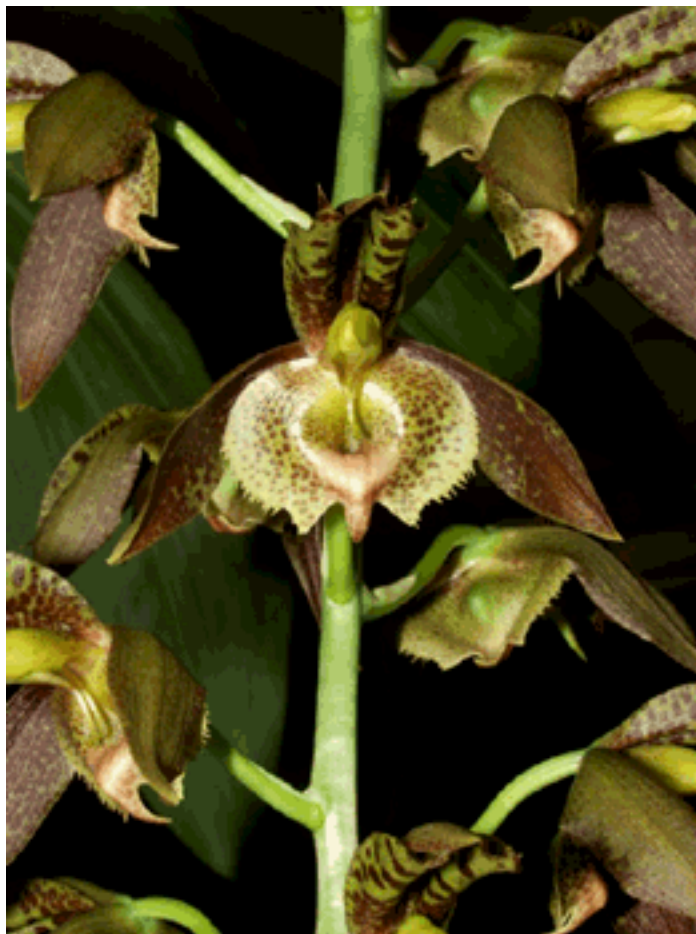
Catasetum Dragon's Teeth 'Sunset'

The AOS judging at Quail Botanical Gardens was held on September 2 with one AM/AOS and one HCC/AOS award granted out of about 10 plants entered for judging. The attendance was down since judging was on Tuesday rather than on Monday to avoid Labor Day and the SDCOS meeting was on the same night, Still, there were some very nice plants shown.