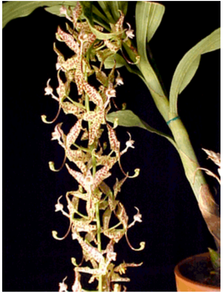
Cycnoches Rocky Plough