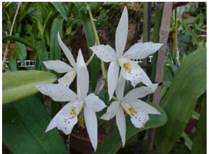
Gerberara Snow Ballet