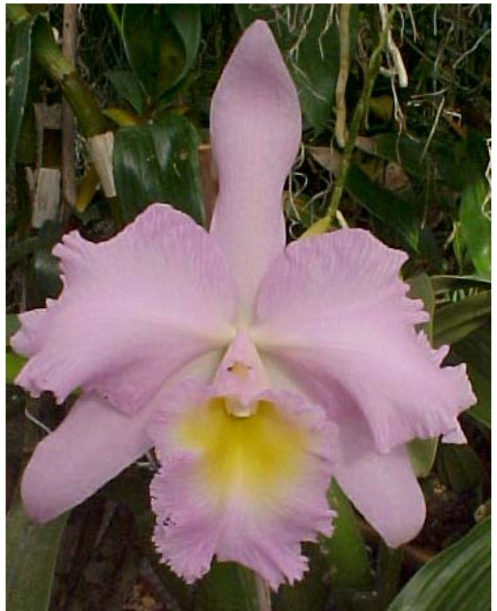
BLC Nacouchee 'Myra' - tip to tip on the petals 8 1/2", height 9" from Ivan and Rosemary Harrison