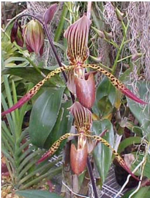
BLC Nacouchee 'Myra' - tip to tip on the petals 8 1/2", height 9" from Ivan and Rosemary Harrison