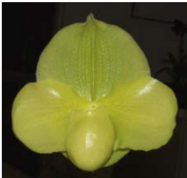
Paph Glitter Gulch 'Rain Circle' HCC

The second AM was granted to another unnamed Paph. (Canticle x Macabre) brought in by Paphanatics. This flower had exceptionally wide petals and a very wide synsepal for breeding from Paph. sukhakulii. The sepals and petals were an unusually nice pastel pink with the characteristic spotting on the petals from Paph. sukhakulii.