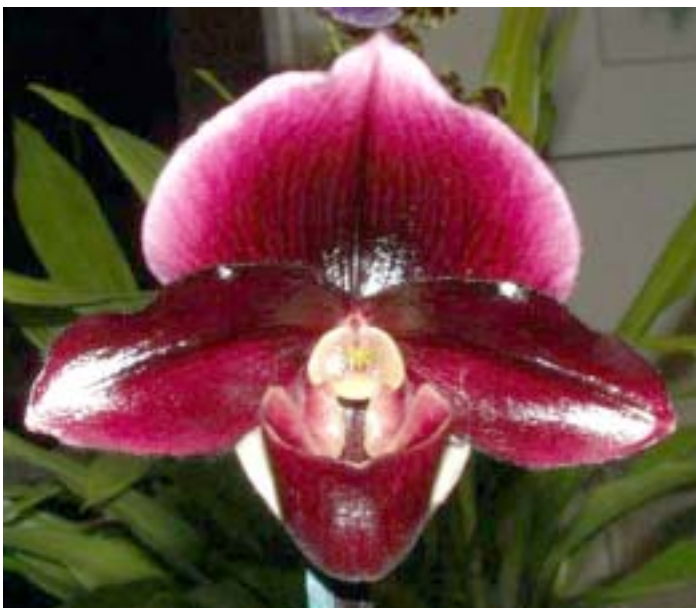
Paph (Deep Space x Incantation) 'Vini Wow' AM