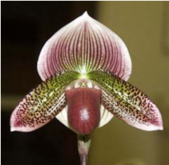
Paph (Canticle x Macabre) 'Jamboree Giant' AM