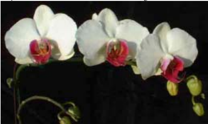
Phalaenopsis White Prince x Snowy Border from Ginger and Mel Ochs