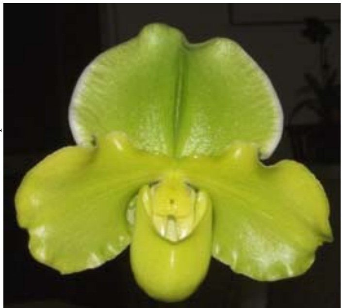
Paph Emerald Sea HCC

The January 5 summary of awards is as follows: