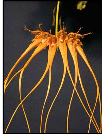
Cirrhopetalum tingabarinum has cilantro-scented blooms that are often as long as the plant is tall.