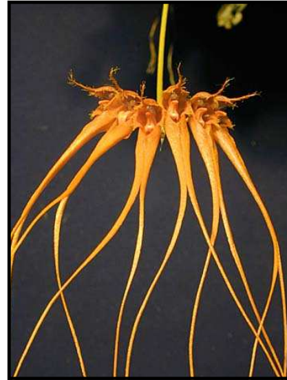
Cirrhopetalum tingabarinum has cilantro-scented blooms that are often as long as the plant is tall.