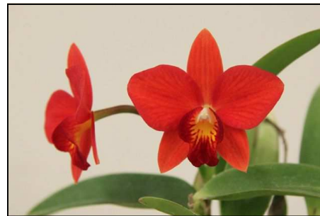
Sophrrolaeliocattleya Mem. Trudi Marsh (Tangerine Jewel x Cosmic Delite) with two flowers on

two inflorescences. The natural spread of the flowers is 5.6 cm. All segments are bright red. HCC/AOS.