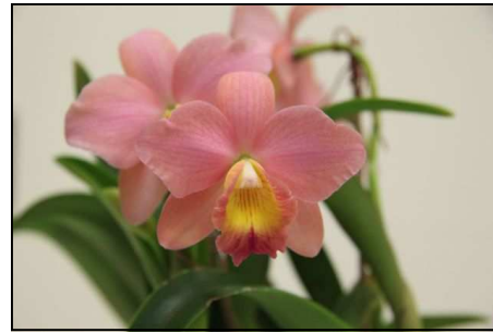
Laeliocattleya Sacramento Rose with four flowers and one bud on three inflorescences.

The natural spread of the flowers is 6.3 cm. Sepals and petals are light pink, the lip is yellow with rose-red margins.