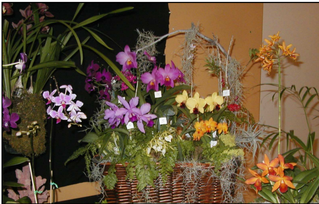
SDCOS Display at the 2010 Newport Harbor Orchid Show

The San Diego County Orchid Society will have an exhibit at the Expo and we need blooming orchids to fill the display. Anyone wishing to display their orchids should contact Dave Hoffmaster ( davehoff5@yahoo.com ) or Bruce Berg ( b2berg@yahoo.com ) to make arrangements for transporting plants to and from the show. Plants in the exhibit will be eligible for AOS or Newport Harbor ribbon judging.