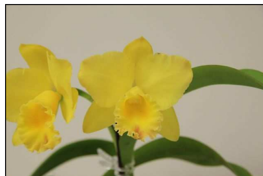
Potinara Cosmo-Zelle (Blc. Goldenzelle x Sc. Beaufort)

two inflorescences. The natural spread of the flowers is 5.6 cm. All segments are bright red. HCC/AOS.