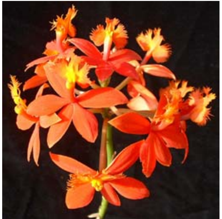
Epidendrum Star Valley 'Lady'