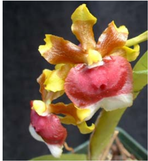
Miltoncidium Hawaiian Sunset 'Hot # 8'