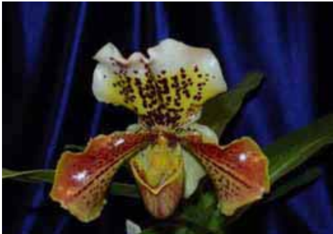
Paphiopedilum Elegy X Winston Churchill 'Ind' FCC/AOS