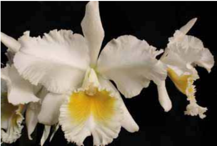
Blc Ranger Six