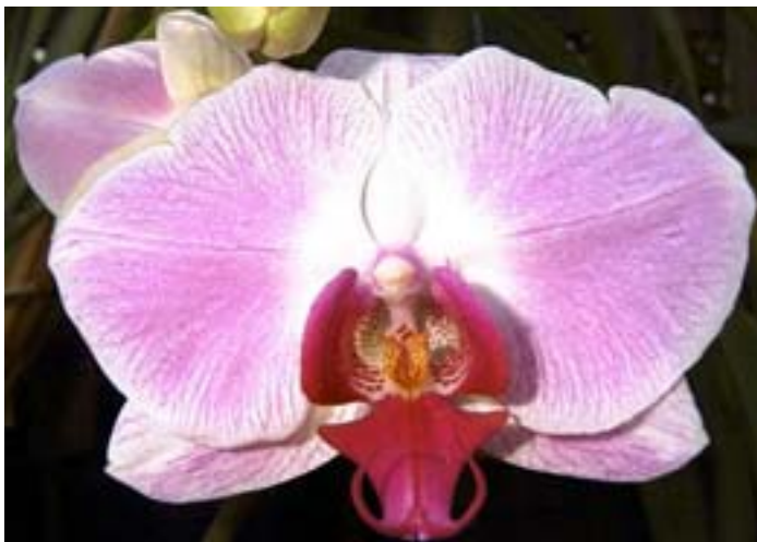
Phal. Arten Nasu X Phal. Taisuco Crane