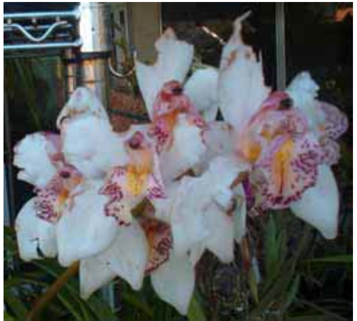
Cymbidiums (above and below) after suffering a hail storm. Yes! Here in Southern California!