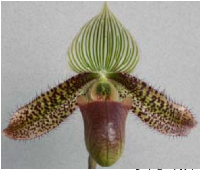
Paph. Darth Vader