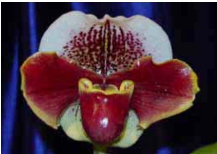
Paphiopedilum Rosalio Bobadilla