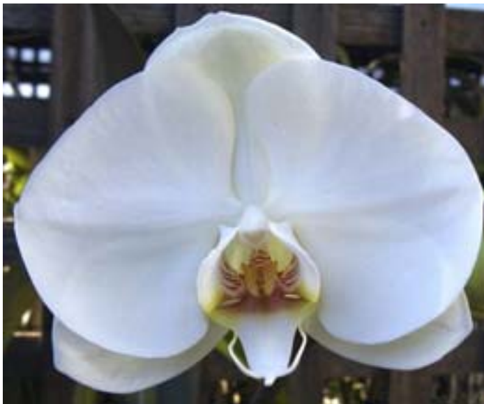
Dtps. No Complaints X No Wonder