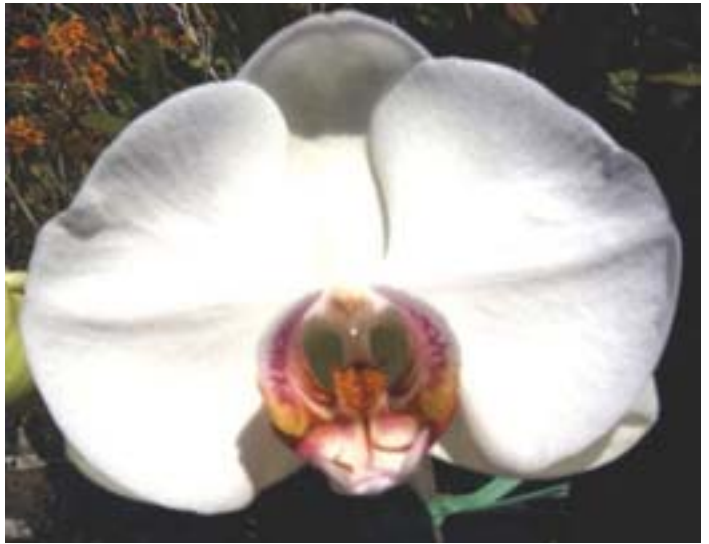
Phal. New Glad X DTPS. Dalin Beauty