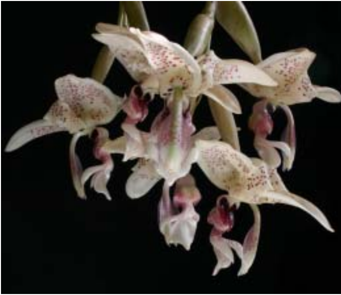
CJ LaBelle - Stanhopia Costaricensis