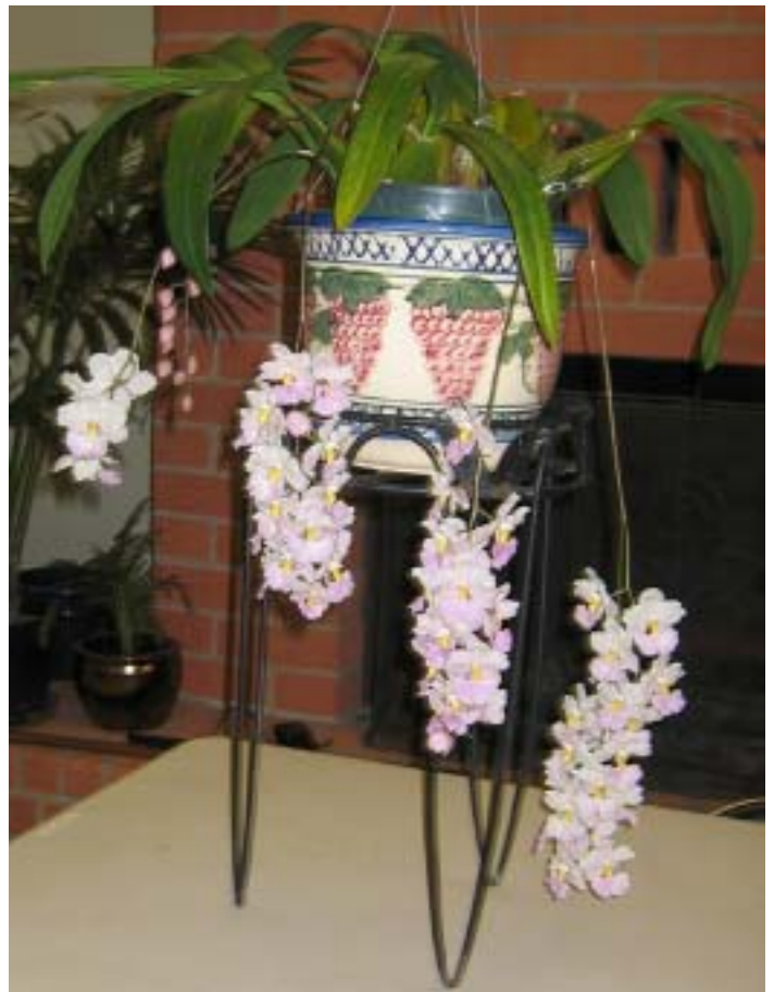
Felisa Acantilado - Cuitlauzina pendula CCM/HCC