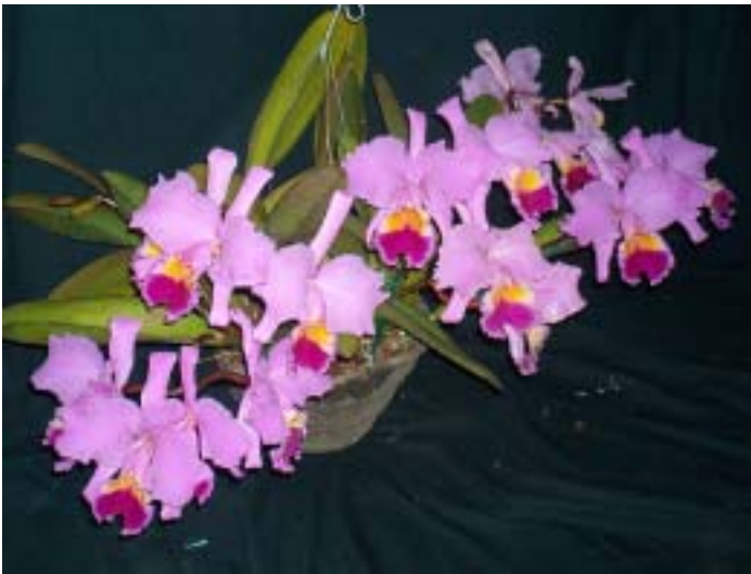
Wade Bogren - Cattleya unknown