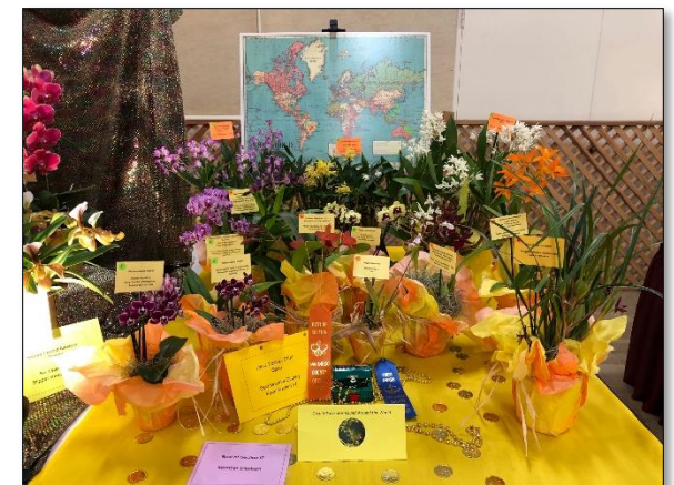
Member display, Spring Show 2019