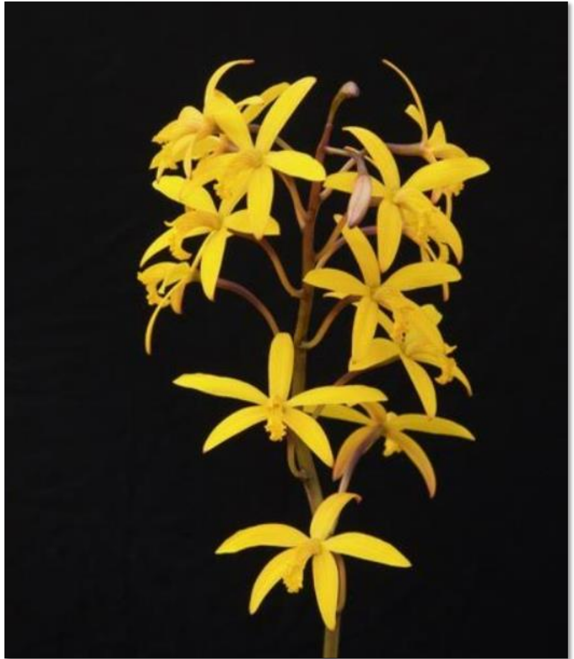
C. hoehnii (formerly L. mixta )