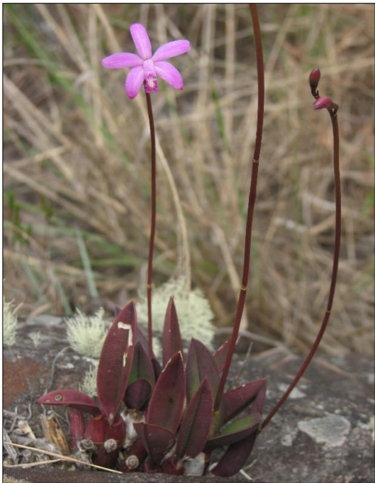
Laelia mantiqueirae/Cattleya caulescens