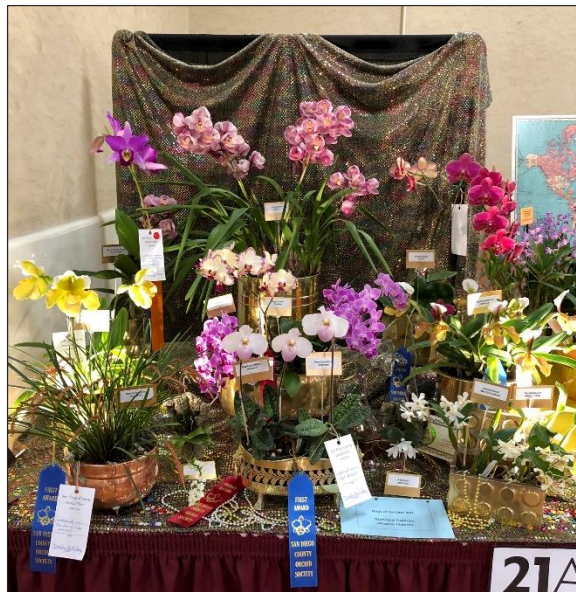
Member displays, Spring Show 2019