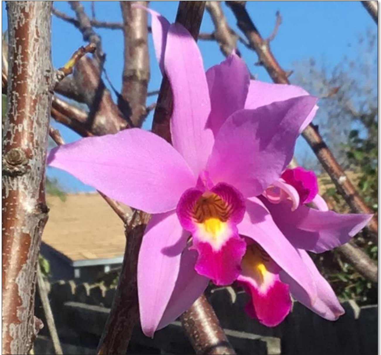
Laelia 'Wallbrnn' Bruce Berg