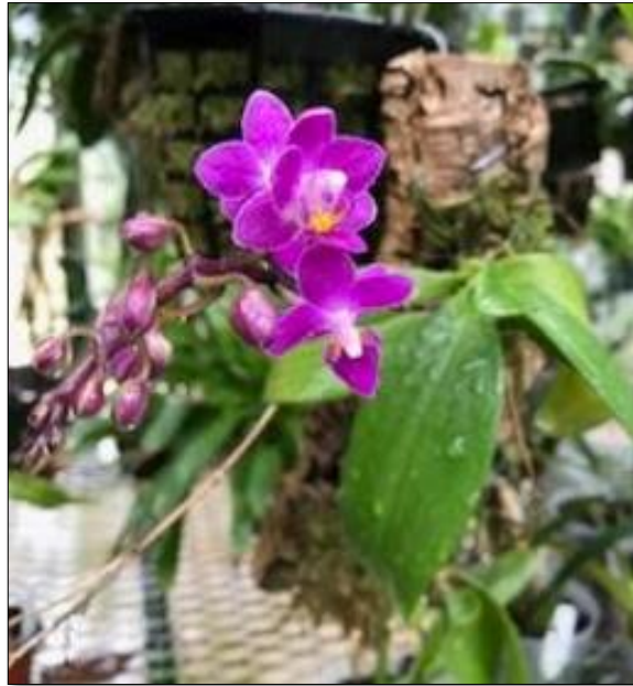
Phal equistris Bruce Hubbard