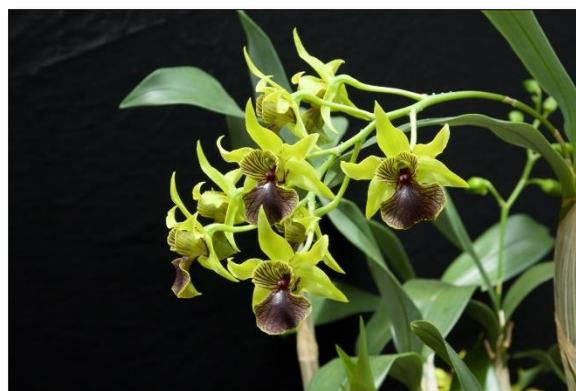
Den. Little Green Apples