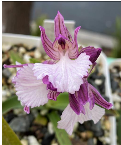
Anacamptis papillionachea v. expansa