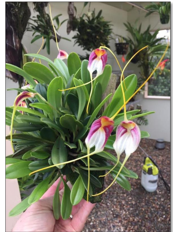
Masdavallia schroederiana Dave Rimlinger

Sunset Valley Orchids offers a 20% discount on all plant orders from your club members. The special voucher code is ZOOM . When you check out, type ZOOM into the voucher code box on the shopping cart page and click 'RECALCULATE' to apply the discount. This special discount is additive to the existing discount schedule, making for an excellent opportunity.