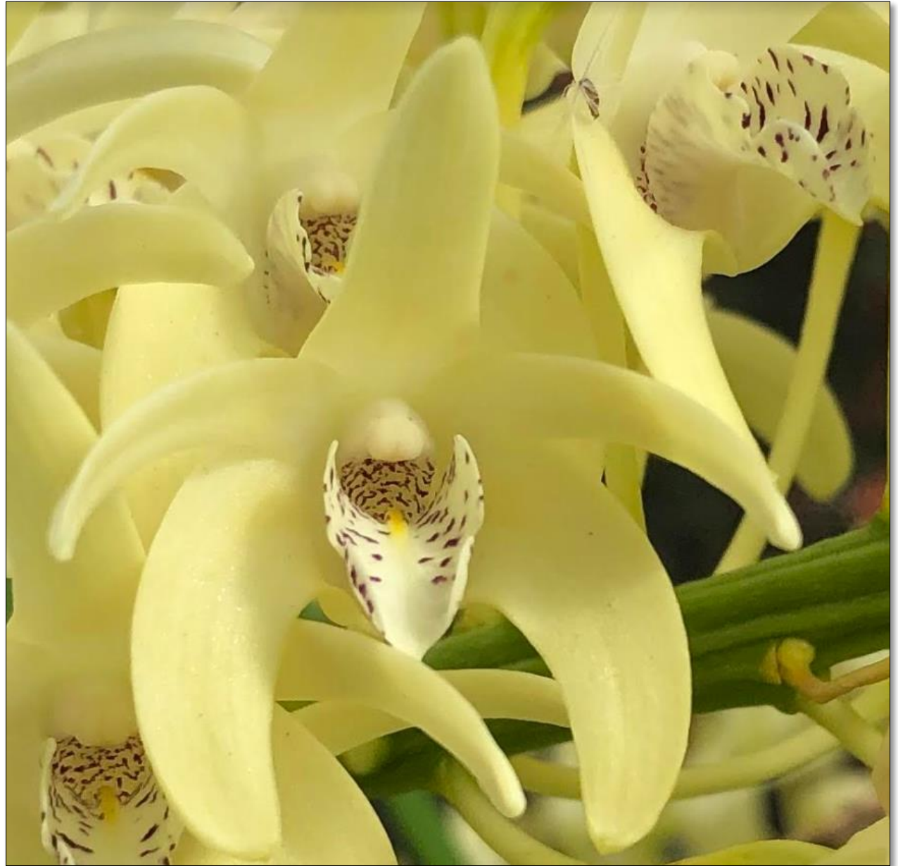
Dendrobium speciosum curvicaule 'Kabi 2010' HCC/AOS Tom Biggart