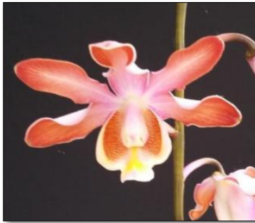
Myrmecophila tibicinis