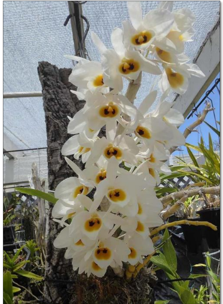
Dendrobium bensoniae Roberta Fox