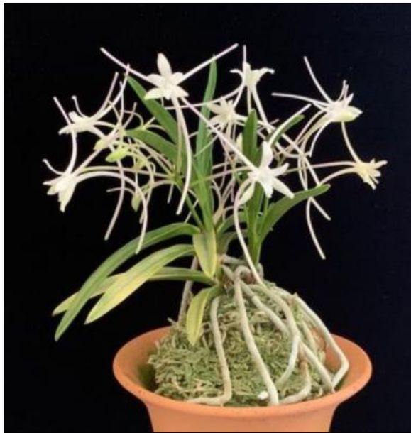
Neofinetia falcata Manjushage 曼珠沙華 (shima and tora) Phyllis Prestia

Phyllis Prestia will give our next class on September 2nd. Her presentation is Repotting and Growing Neofinetias . It can be accessed through the same link as our