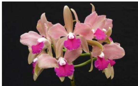
Cattleya Jolly Debby Halliday