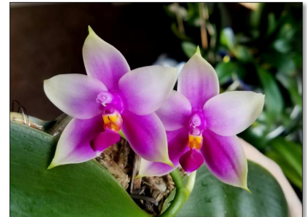
Phalaenopsis bellina

Note: The report submitted for the period covered by the first grant provided to The Ridges Sanctuary was considered by the Conservation Committee and the SDCOS board to be substandard. We are asking the membership to approve this award conditionally, pending receipt of a more acceptable report. If the membership provides conditional approval, the Conservation Committee chair will contact the submitter and request a revised report. If the revised report is acceptable to the Conservation Committee and the SDCOS board, the grant will be awarded.