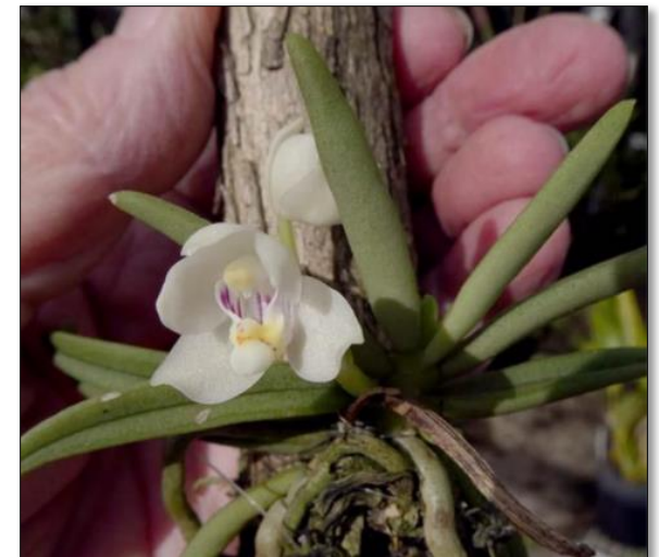
Pteroceras ( Brachypeza ) Semiteretifolia Roberta Fox