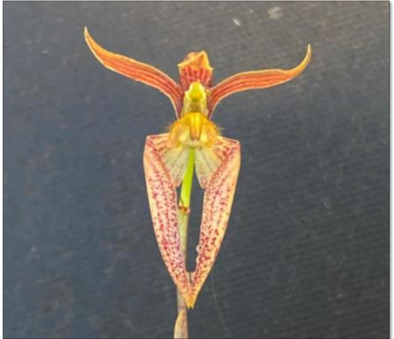
Bulbophyllum lasiochilum Betty Kelepecz