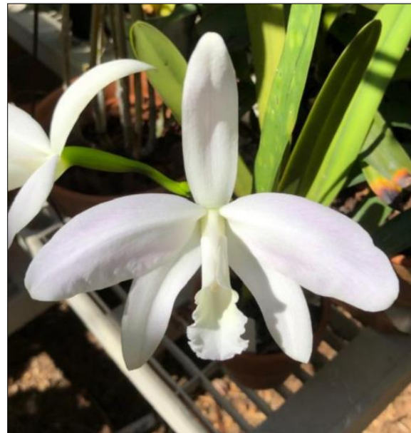
Laelia perrinii ( delicata x semi- alba ) Tom Biggart