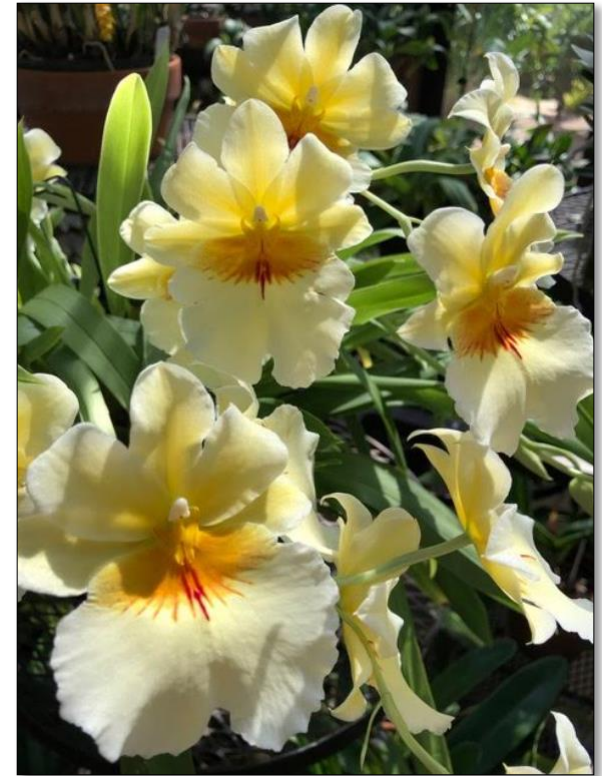
Miltoniopsis No ID Debby Halliday

Keep growing and enjoying your beautiful plants. They are an enduring bit of normalcy in these difficult times.