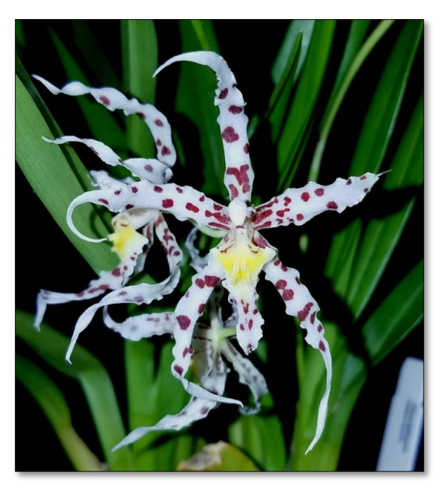
Odontoglossum (Oncidium) naevium Rachel Burns