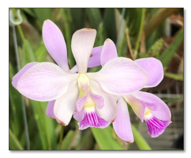
Encyclia dichroma