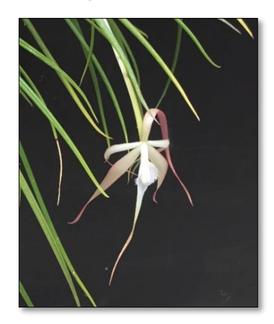
In my greenhouse today, What was waiting for me? But a Brassavola Cucullata Peeking at me! All shiny!

November B, Cucullata, a Poem. Text by Bruce Berg