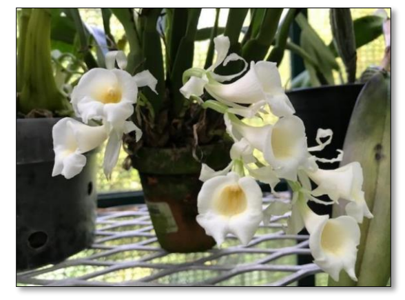
Trichopilia rostrata