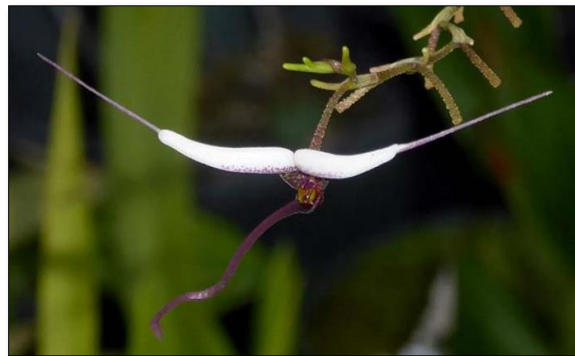
Scaphosepalum gibberosum Roberta Fox