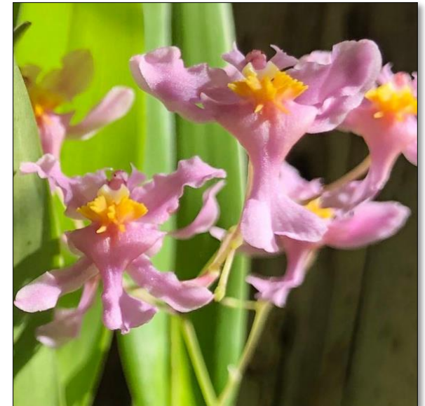
Oncidium sotoanum Ashley Grable

Your membership supports our plant and animal collections and includes a monthly visit to our Orchid Odyssey on the third Friday of each month from 10am until 2pm.