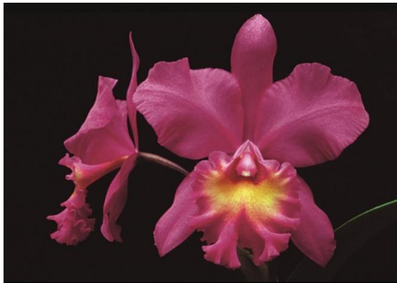
Blc. Bryce Canyon ‘Splendiferous’ Culture Class, February 3, 7:30 PM

He grows a variety of hybrids and species in Jacksonville, Florida, but his favorites are the great Cattleya hybrids. He has about 500 mature Cattleyas in his shade house, including some classic clones which appeared in collections over 100 years ago. He makes 10 to 15 hybrids and species sib crosses each year, and periodically offers them for sale.