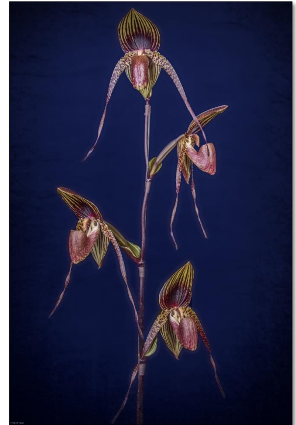
Paph. Johanna Burkhardt 'Suzanne' AM/AOS