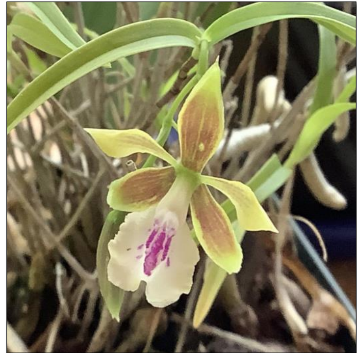
Epidendrum tetraceros Pam Peters