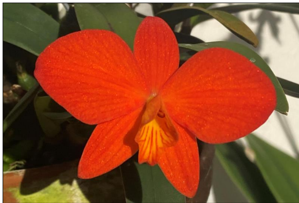
Sophronitis bicolor Betty Kelepecz