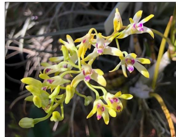
Dendrobium canaliculatum Tom Biggart