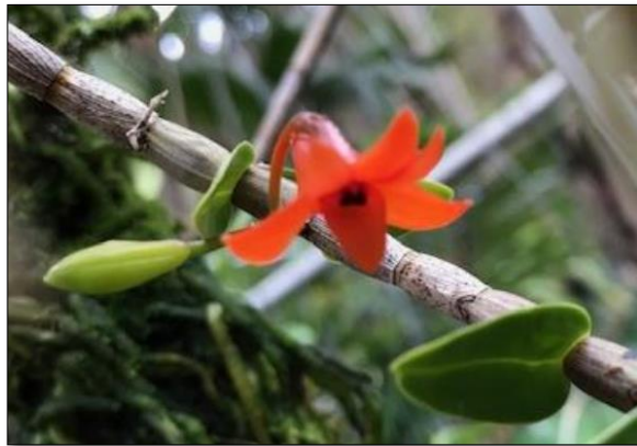
Clowesia warczewitzii Bruce Hubbard