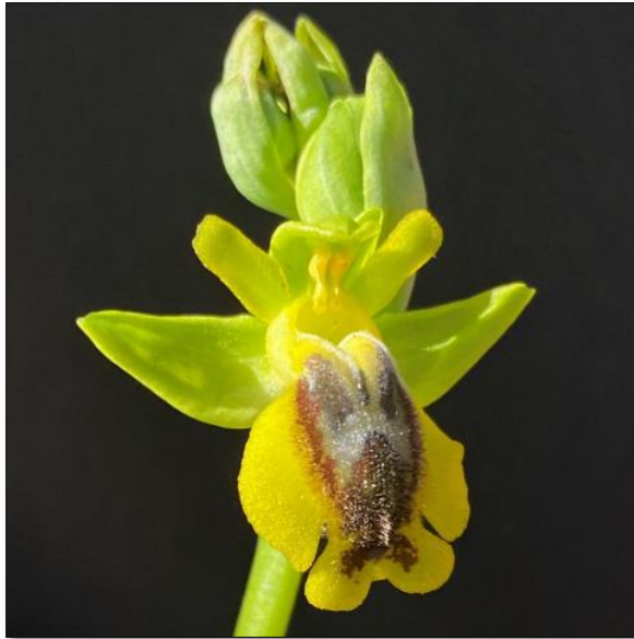
Ophrys lutea