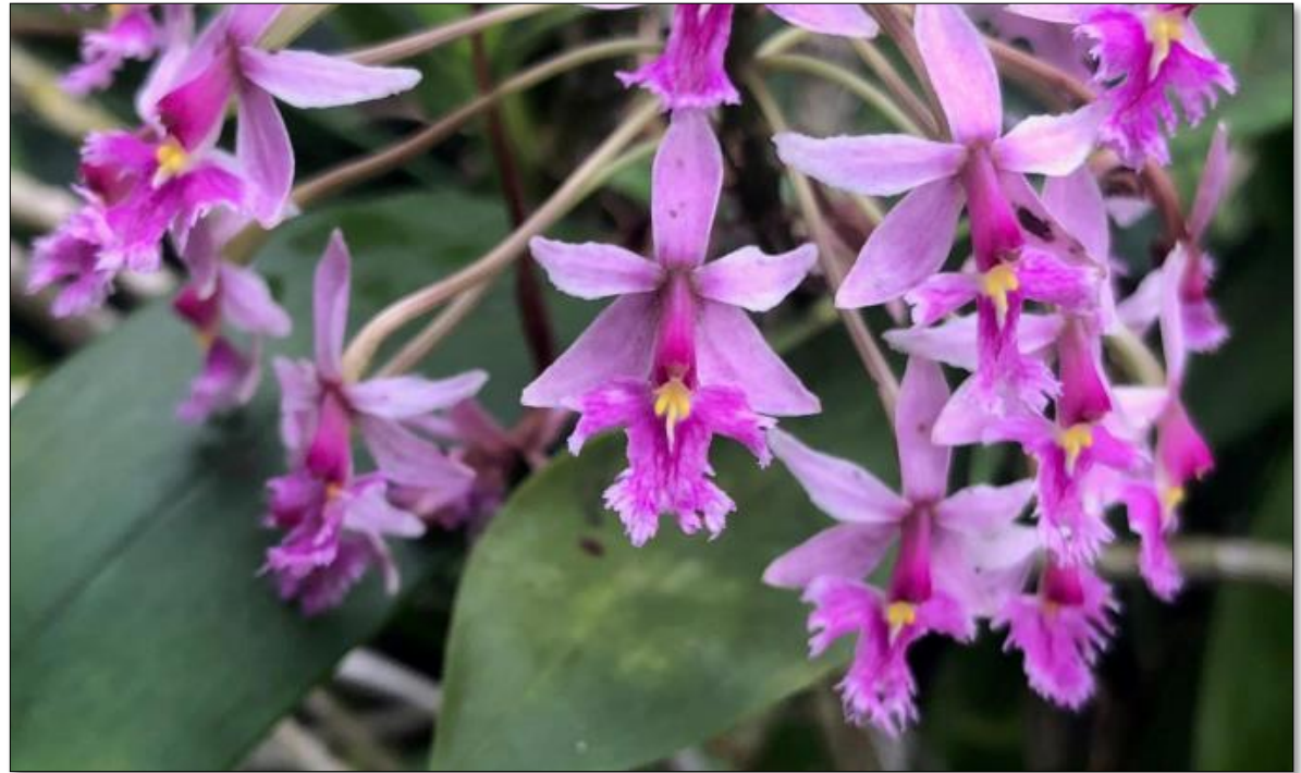
Epidendrum calanthurum Peter Tobias

Open daily: Mon-Sat, 8 to 4:30, Sun 11-4 1250 Orchid Drive, Santa Barbara, CA 93111 (800) 553-3387 sboe@sborchid.com