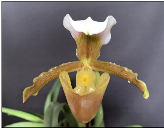
Paphiopedilum vejvarutianum