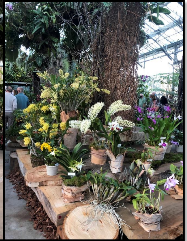
SDBG Show Pictures