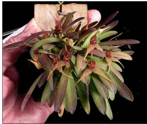
Dryadella zebrina