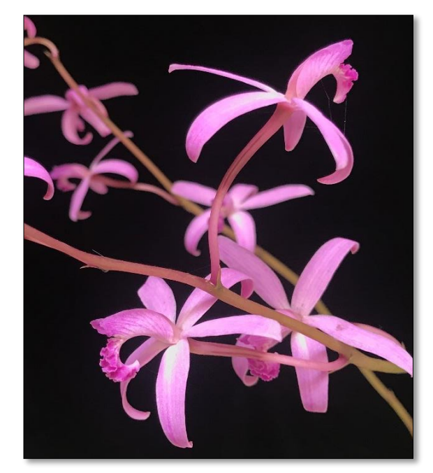
Rupicolous Laelias of Brazil