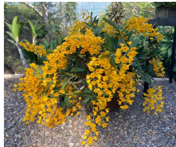
Dendrobium chrysotoxum