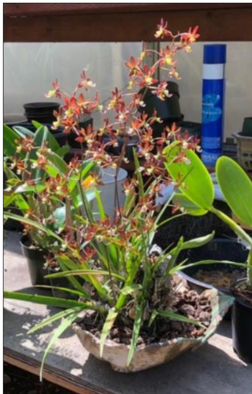
Encyclia dickensoniana