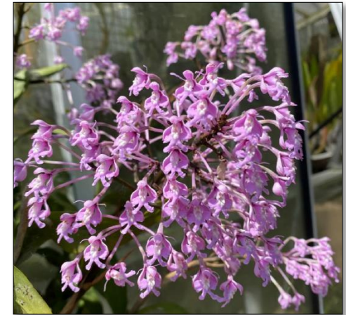
Epidendrum atacazoicum 'Windflower' CBR/AOS Betty Kelepecz