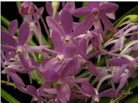
Ascofinetia Cherry Blossom 'Pink Panther' HCC/AOS Peter Lin

Vandas are not the most common orchid in most collections, but they offer some of the most dramatic displays of all the genera. They often display bright colors and lots of long-lasting flowers on big plants. If you are space-challenged and want to grow Vandas, this is the talk for you! Learn about the many compact species within the Vanda alliance and their hybrids. This is a fast-paced Powerpoint presentation that includes many pictures and cultural tips. Peter will be providing some of the plants for our raffle table.