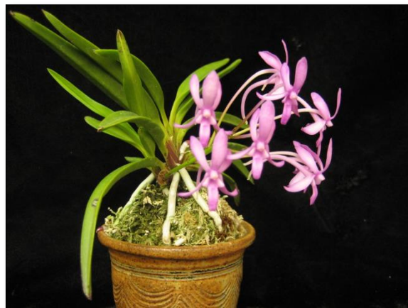
Dar. Rainbow Stars 'Pink Pearl' HCC-AOS