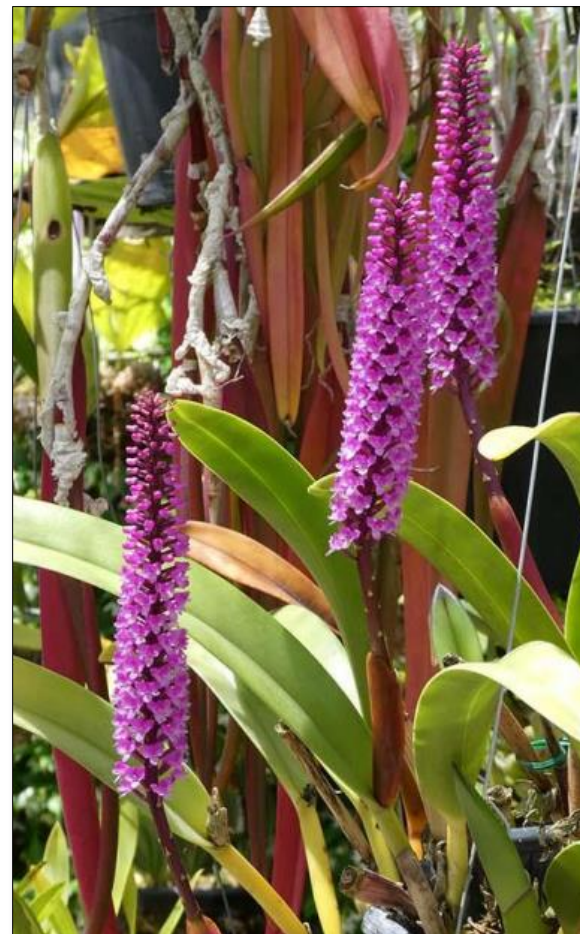
Arpophyllum giganteum Roberta Fox