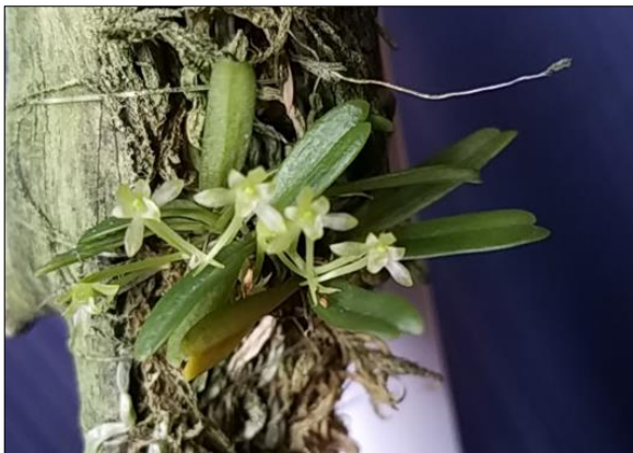
Mystacidium alicae David Vandebroek

Looking forward to restarting these with you!