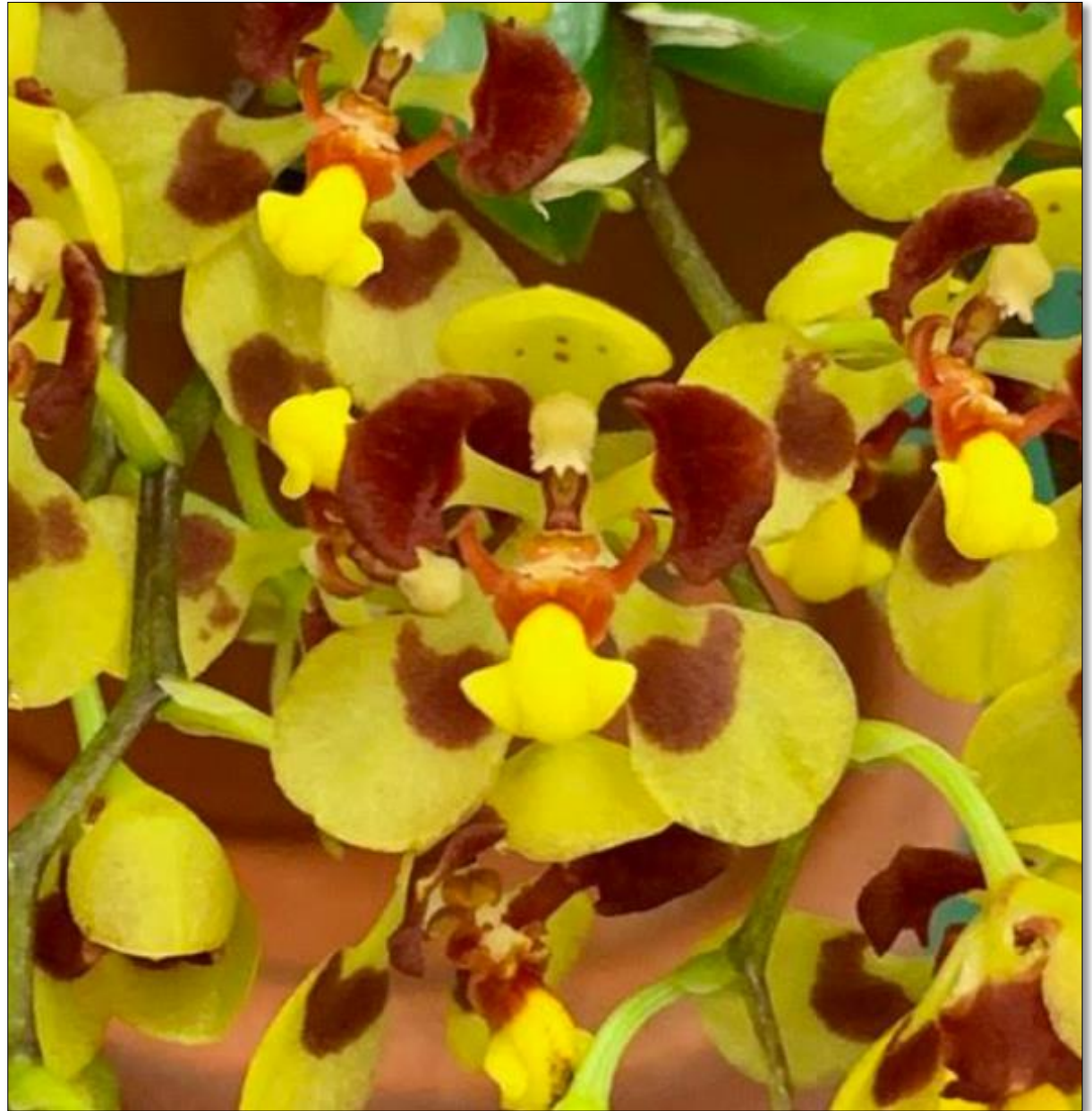
Gomea colorata 'Precious Treasure' AM/AOS Jack Li (See awards on Page 5)