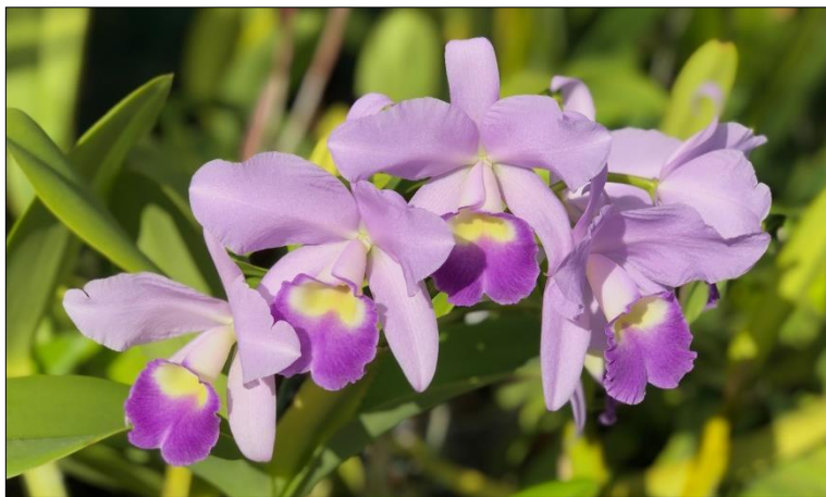
Lc. Portia coerulea x Lc. Love Knot 'Blue Sky' Debby Halliday