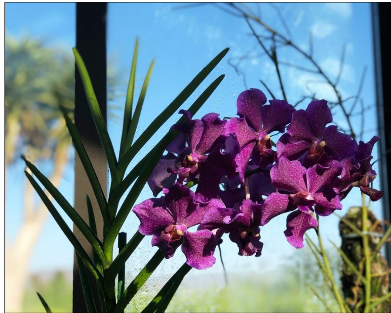
Vanda Hybrid Debby Halliday