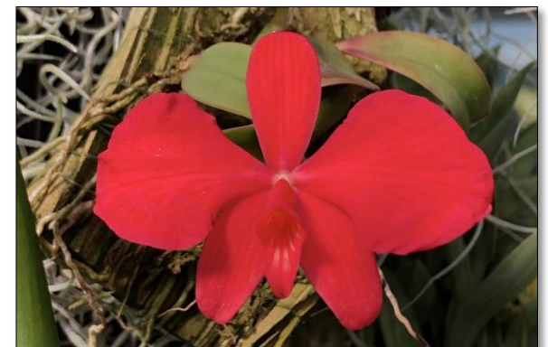
Cattleya brevipedunculata Debby Halliday

Lots to look forward to! Stay well, nurture your orchids and I'll see you in January!