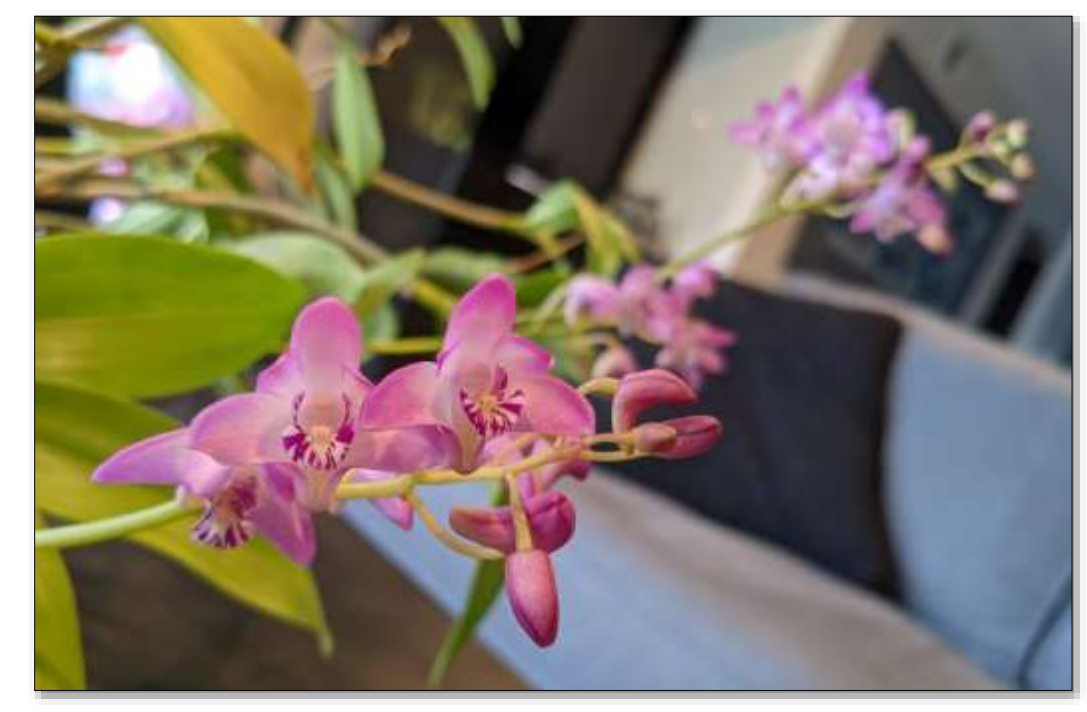
Dendrobium kingianum David Vandenbroek

Every day a different orchid—check out "Orchid-of-the-Day" at www.sborchid.com Specializing in outdoor-growing orchids for coastal California, incl. Laelia anceps and hybrids, Cymbidium species and hybrids, and species. Temporarily closed due to covid <u>https://www.sborchid.com</u> 1250 Orchid Drive, Santa Barbara, CA 93111 (800) 553-3387 sboe@sborchid.com