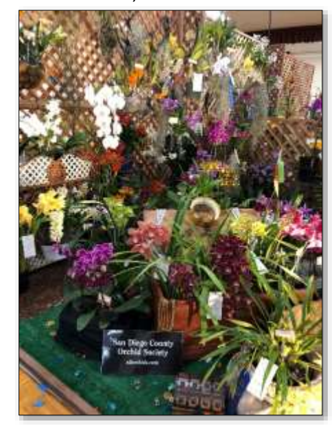
SDCOS Floor Display

The Spring Show and Orchid Magic is almost here! After missing 2020 and 2021, it's exciting to be putting on our big event again. Only one more meeting before it's showtime! I hope you will all try to attend our March 1 meeting in person. We may still need to wear masks, but we look forward to seeing everyone who can come to this important meeting. (There will still be a Zoom feed if you can't make it.)