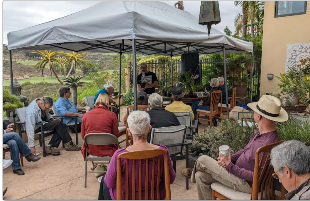
SDCOS Species Group auction to raise money for orchid conservation

For others willing to contribute plants to raise money for orchid conservation (through grants issued by the Society at the recommendation of the Conservation Committee), please consider bringing extra plants or divisions to our Summer Show in the Park for sale at the Conservation table.