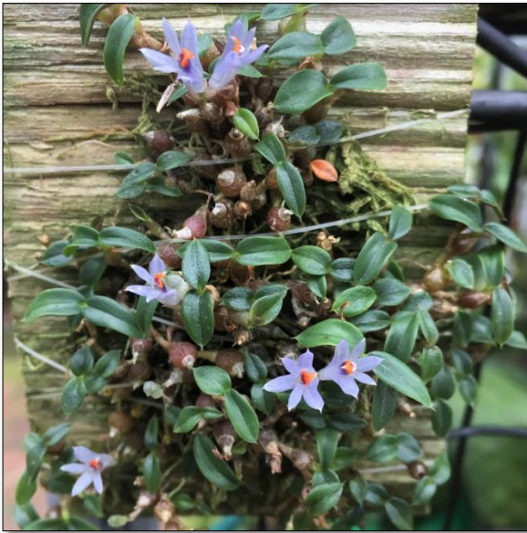
Dendrobium parvulum

Culture class will be held at 6:30 PM as usual.