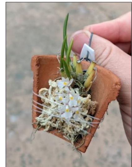
Capanemia superflua