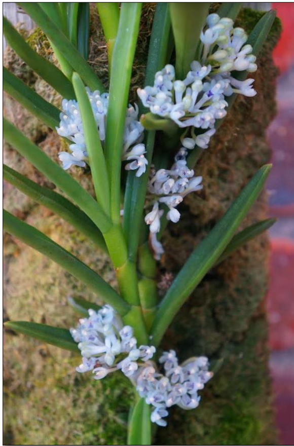
Cleisocentron gokusingii

Blue orchids have a mystique—exotic, rare and unobtainable. They are an object of