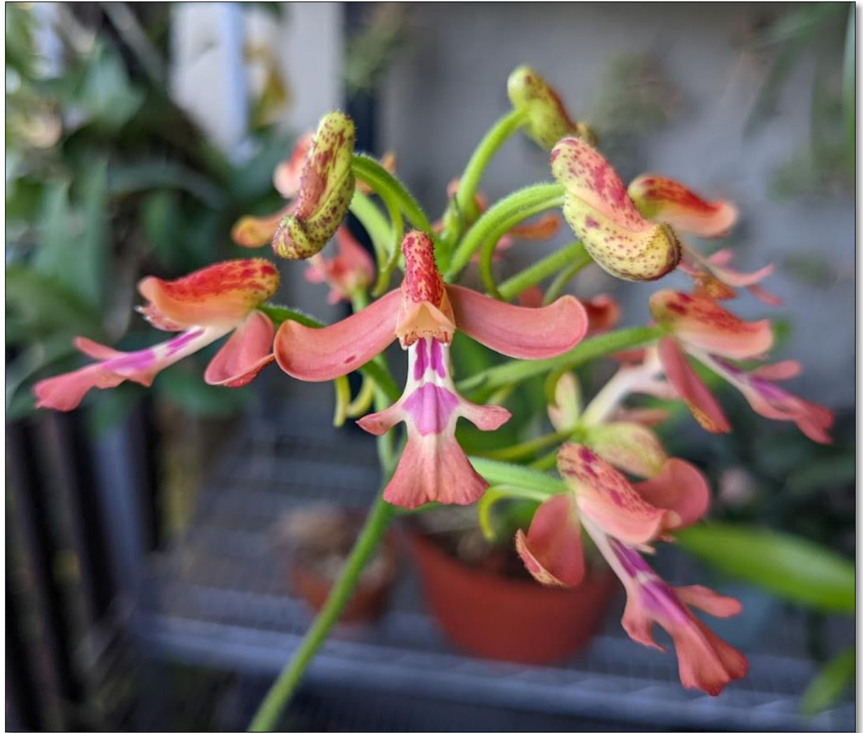
Cynorkis gibbosa