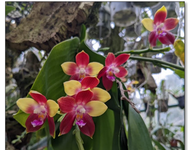
Phalaenopsis Tying Shin Fly Eagle 'Wilson' HCC/AOS Bruce Hubbard