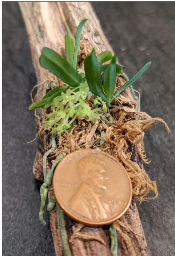
Mystacidium aliciae David Vandebroek

The SDCOS Board meeting minutes can be found at: http://sdorchids.com/Minutes.html