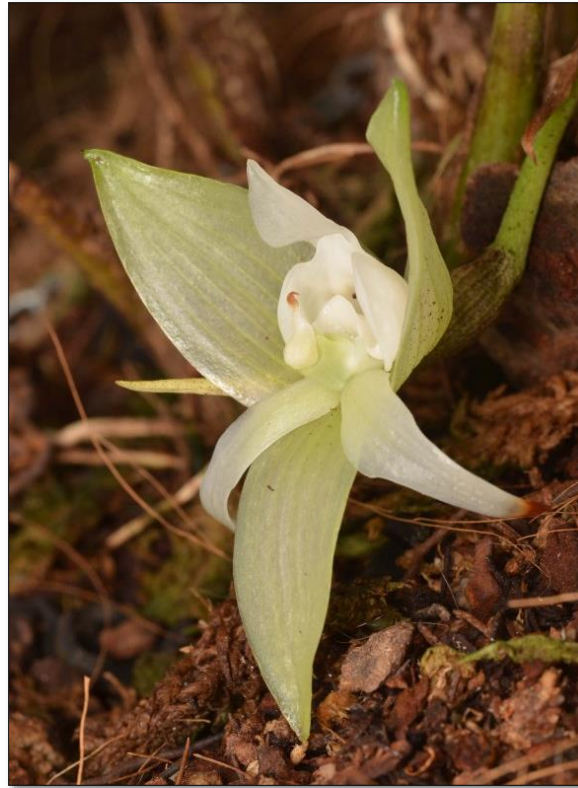
(Above) Trevoria sp. nov. New species discovered in the Dracula Reserve