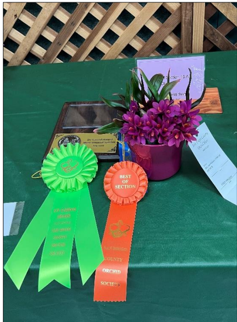
Den. laevifolium 'Little Joy' HCC/AOS Debby Halliday

Almost 500 people voted for our People's Choice Award. That indicates a very healthy turnout of show visitors. 91 individual plants from 14 different growers earned at least one vote as someone's favorite. The point of People's Choice is to slow visitors down and encourage them to really look at the flowers.