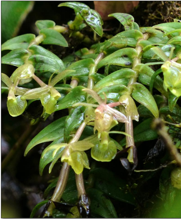
An orchid from the Dracula Reserve