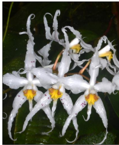
An orchid from the Dracula Reserve

The SDCOS Board meeting minutes can be found at: http://sdorchids.com/Minutes.html