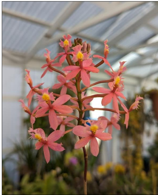
Epidendrum Stewart Walton