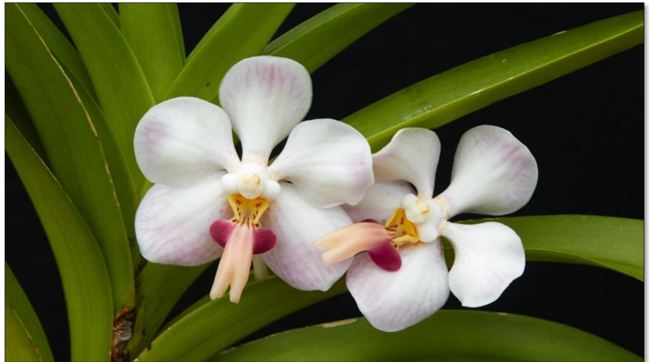
Vanda foetida Debby Halliday

As you can see, there are lots of orchid activities coming up. Take good care of your plants so they will be looking their best and ready to party! In the meantime, I look forward to seeing you at our meeting on February 7.