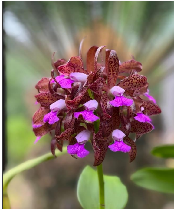
Cattleya tigrina Debby Halliday

Hope to see you at the meeting on Tuesday – happy growing!