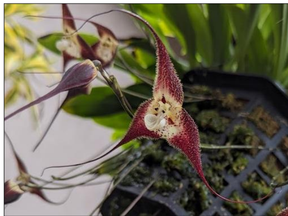
Dracula tubearia