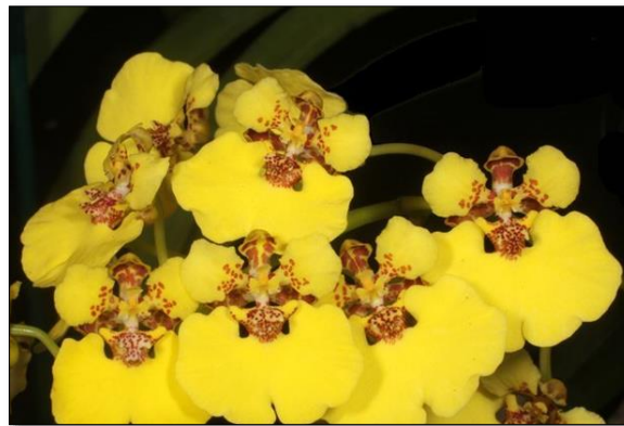
Rossioglossum ampliatum v. majus 'Merienda Lane' AM/AOS