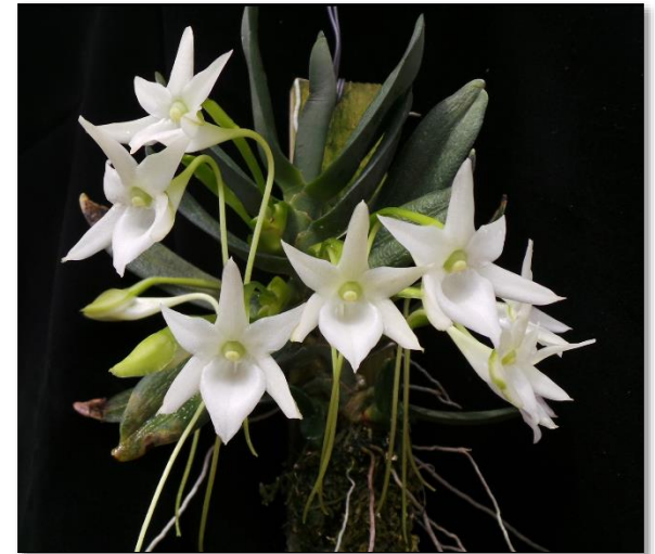
Angraecum compactum

SDCOS members are invited to join, at their own expense, dinner with the main speaker on the evening of the presentation. To secure your seat, email 1stVP@sdorchids.com by Monday, November 6. Please arrive at the restaurant