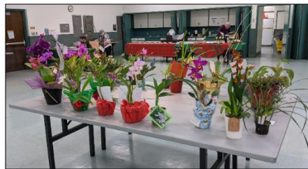
2021 Plant Exchange Table

https://www.surveymonkey.com/r/MFJ93ST to secure your free gift plant at the