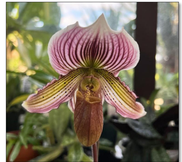
Paph. Night Pulse x fairreanum Debby Halliday