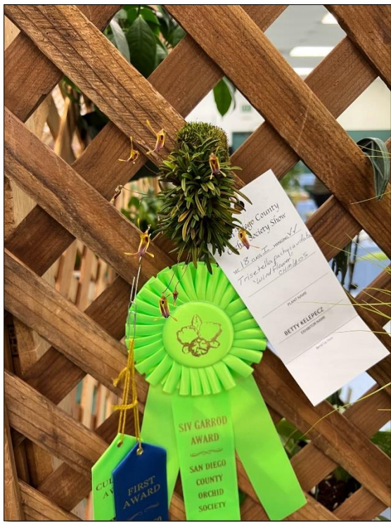
Trisetella pachycaudata 'Windflower' CHM/AOS Betty Kelepecz

We had a great selection of 168 plants on display. Our species areas were filled with intriguing and unusual orchids, much to the