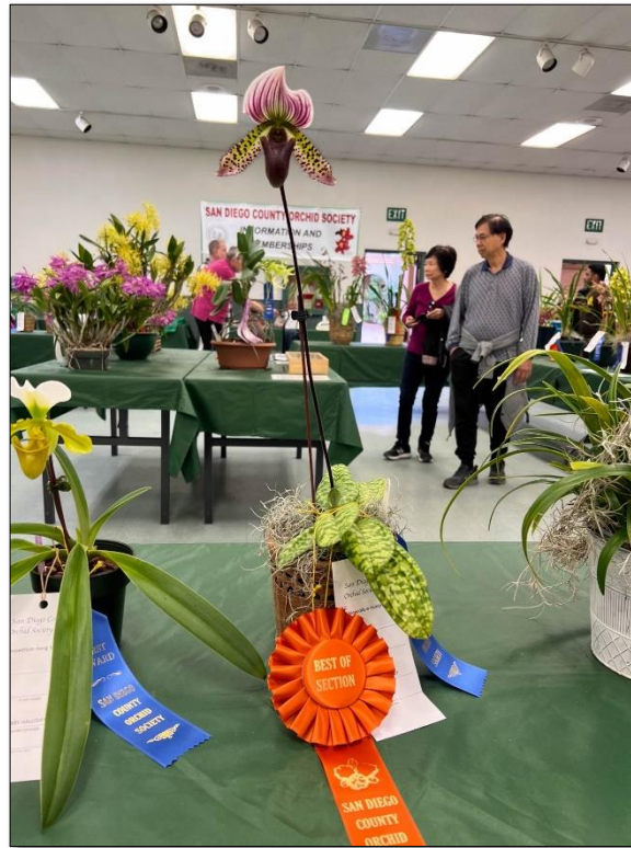
Paphiopedilum Hsinying Alien Debby Halliday