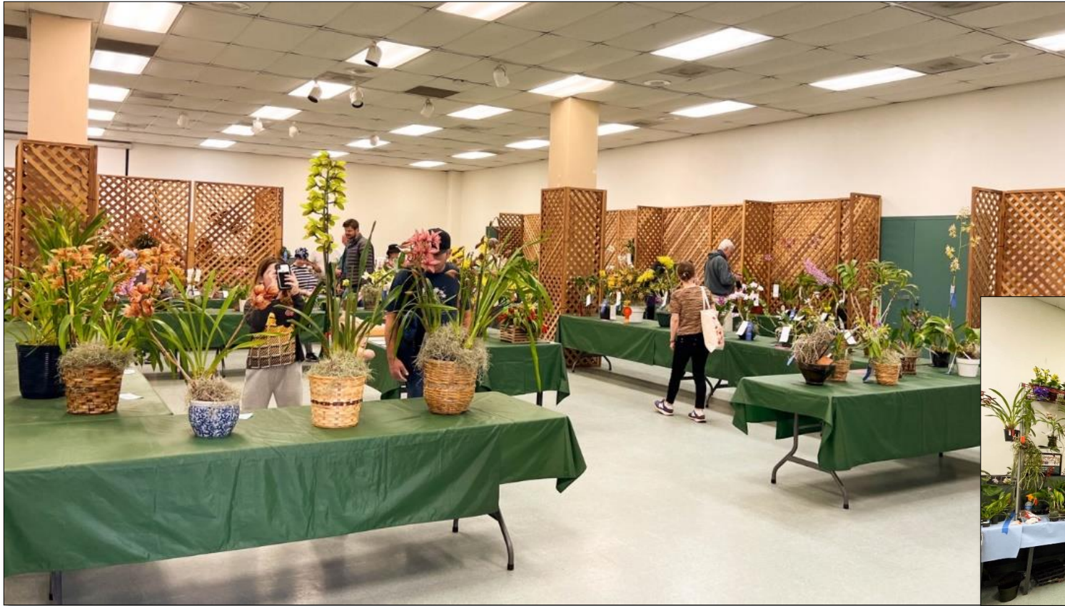
SDCOS January 2024 Show Pictures