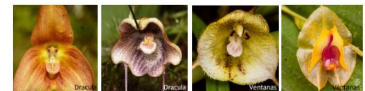
Dracula gigas (L), D. trigonopetala (R) Dracula lemurella (L), Lepanthes escifera (R) Dracula Reserve, Ecuador La Selva de Ventanas Reserve, Colombia

The OCA conserves orchids by funding habitat preservation. Since inception in 2005 we have helped with the purchase of over 3000 acres of orchid habitat, protecting hundreds of orchid species in Brazil, Ecuador and Colombia. Many species of rare birds, trees, frogs, mammals also find refuge in these reserves.