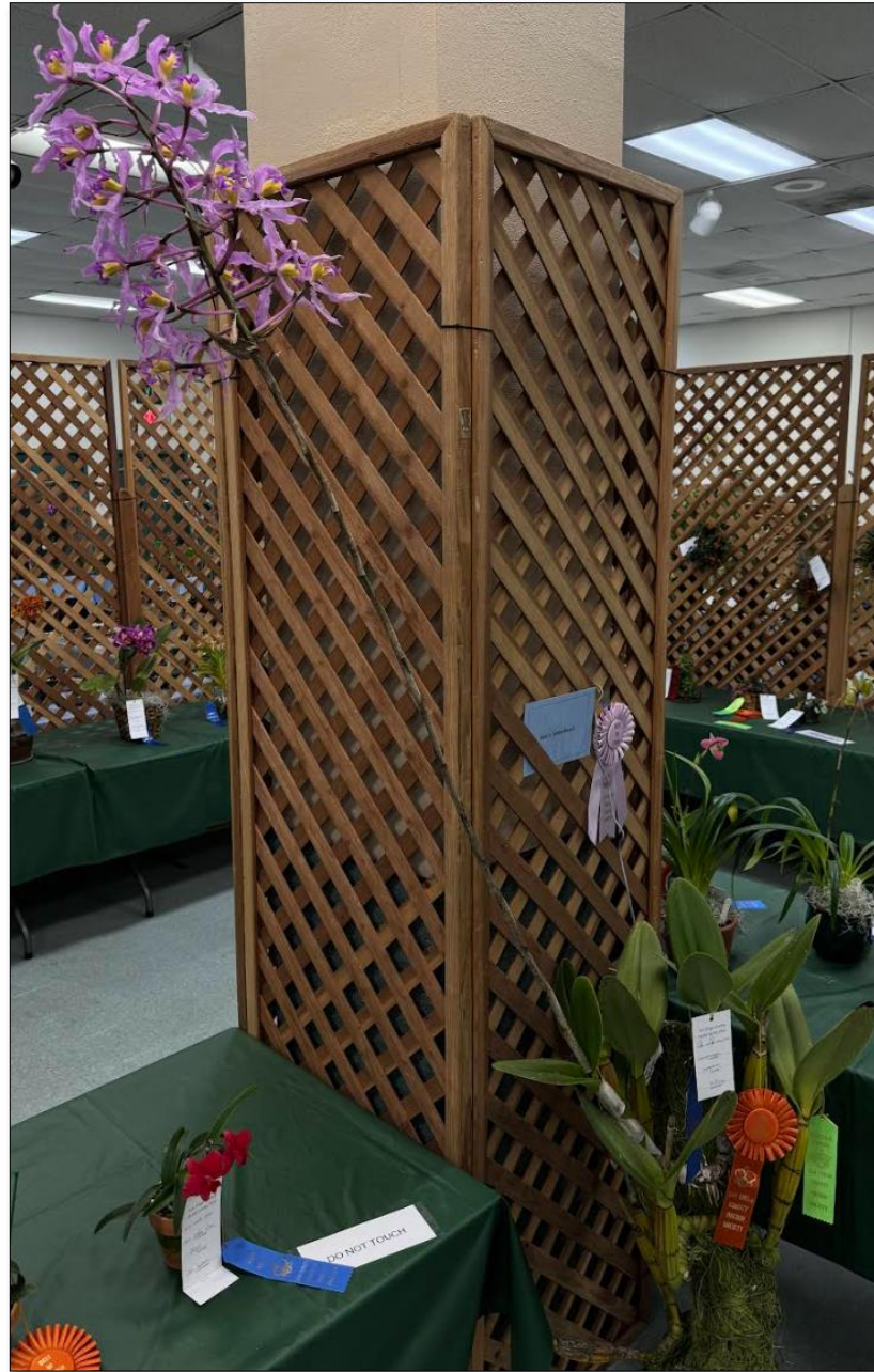
Schomburgkia superbiens Bill Loy Best in Show, January 2025