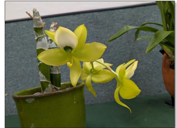
Cycnoches chlorochilon Rachel Burns