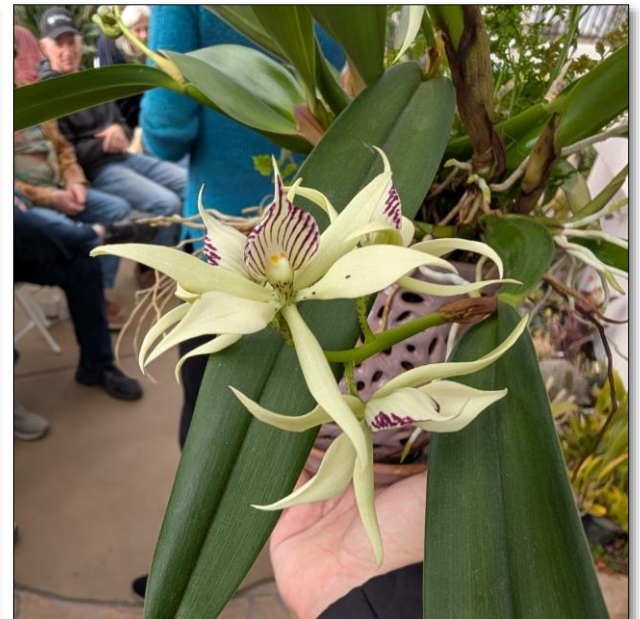
Species Orchids seen at Species Study Group