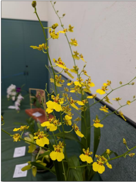
Oncidium Gower Ramsey Bruce Kidd