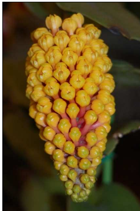
Ontario Orchids seized the Wilson Trophy for the Most Unusual Orchid Flower with this Robiquetia cerina .