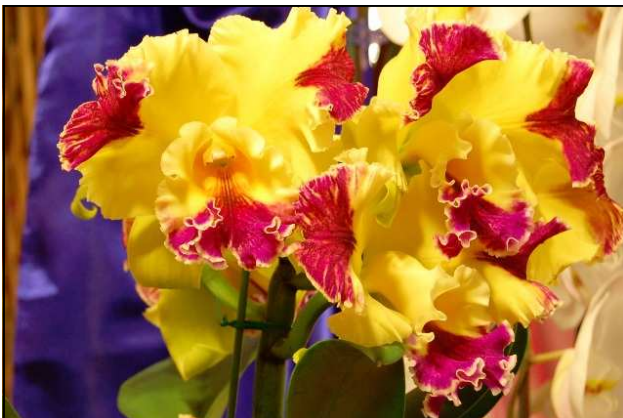
Ontario Orchids took the Canale Trophy for the Best Colored Cattleya with this Blc. Hwa Yuan Grace 'Cat King'.