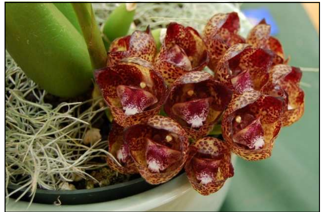
Peristeria pendula exhibited by the San Diego Zoo earned a Best of Section and a Cultural Award with these flowers that smelled like burnt Bakelite.