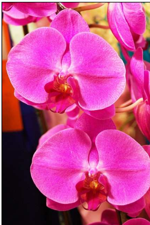
Ontario Orchids also won the Bertsch Trophy for Best Intergeneric Trophy excluding Cattleya and Cymbidium with this Dtps. Soso Davis 'T.L.'.