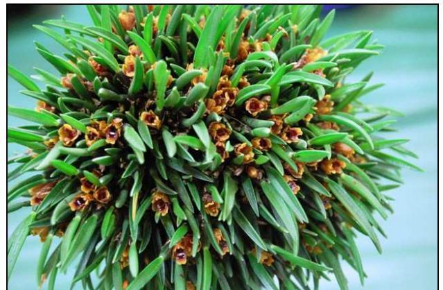
The Best Specimen Plant Trophy was awarded to the San Diego Zoo for this Maxillaria echinophita .