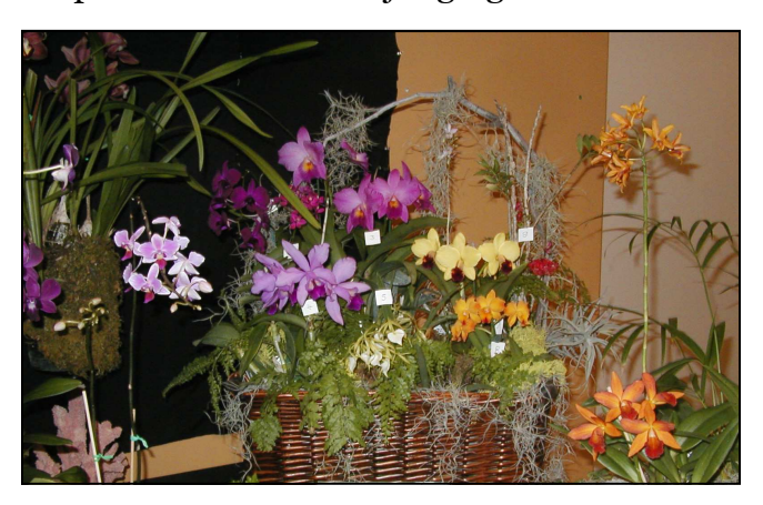
SDCOS Display at the 2010 Newport Harbor Orchid Show

The San Diego County Orchid Society will have an exhibit at the Expo and we need blooming orchids to fill the display. Anyone wishing to display their orchids should contact to Dave Hoffmaster (davehoff5@yahoo.com) or Bruce Berg (b2berg@yahoo.com) to make arrangements for transporting plants to and from the show. Plants in the exhibit will be eligible for AOS or Newport Harbor ribbon judging.