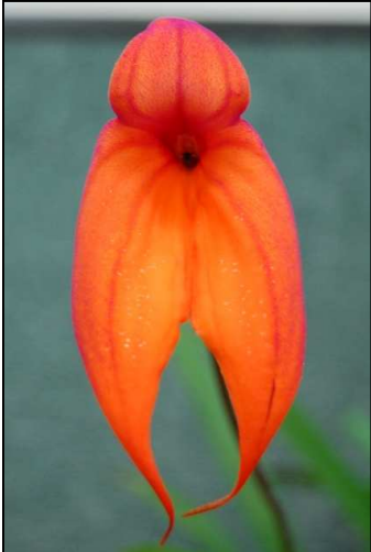
My Masdevallia veitchiana 'Sol' scored 1st place in section 12-S, and had five open flowers, all about 4" long. Found around Machu Picchu, this is the largest and gaudiest Masdevallia species. This was a $3 Conservation Committee purchase, as I recall.