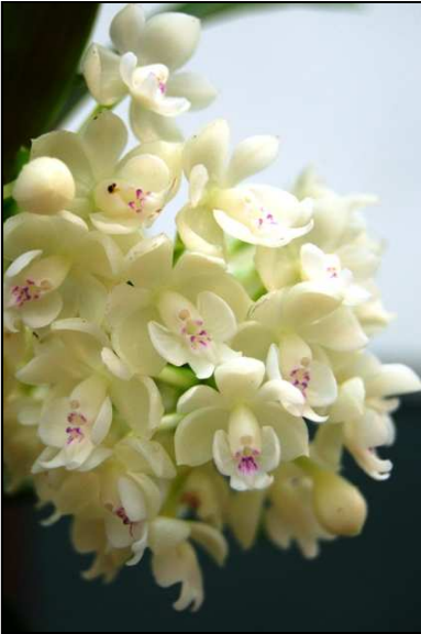
Epi. hugomedinae is a perfect example of how many orchids are named after people. Charlie and Sue Fouquette brought this one in, and the Ivory-soap/sycamore pollen-scented blooms earned it a 2nd place in section 12O.