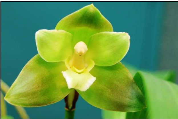
Lycaste Guenivere earned Parkview Orchids a 1st place in section 10I. This is a nice greenish-olive flower with a white lip with yellow calli.