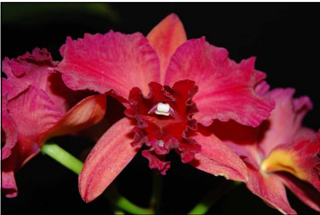
The Dellingers exhibited this Blc. Tzymi Charm for a 1st place/Best of Section 5. This one had a great fragrance and held up well under flash photography.