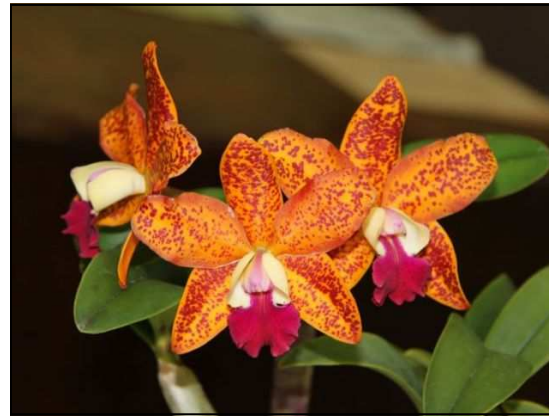
Awarded AM/AOS 84 points

Here are some of the others presented for judging: