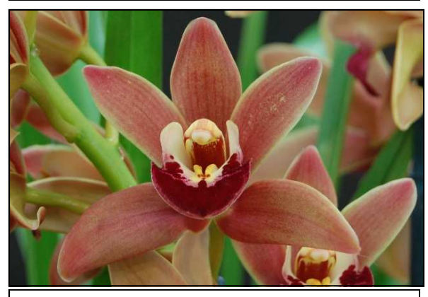
Felisa (P.) Acantilado's Cymbidium had so many things involved in its parentage that I can't mention them all here. It took 1st Place and Best of Section 2.