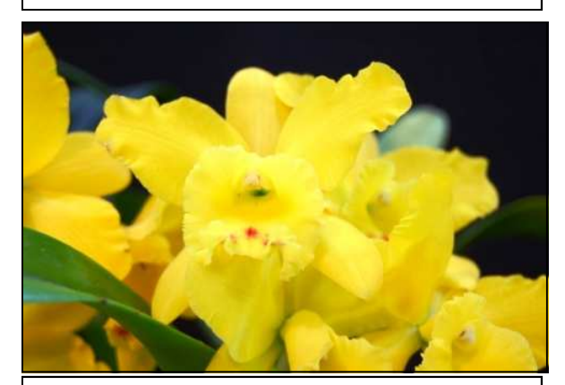
Blc. Husky Boy 'Romeo' earned a 1st Place and Best of Section 5. Ken Campbell brought this beautiful plant to flower.