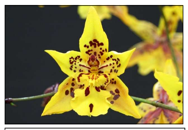
Odcdm. Tiger Crow 'Golden Girl' grown by Debbie Halliday took 1st Place and Best of Section 9. The "Od" part of "Odcdm." stands for "Odontoglossum," indicating that this plant can be grown outdoors.