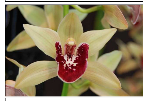
Cymbidium Camouflage Candy 'Geyserland' x C. devonianum took 1st Place, Best of Show, and Best of Section 3, and was grown by the Acantilados.