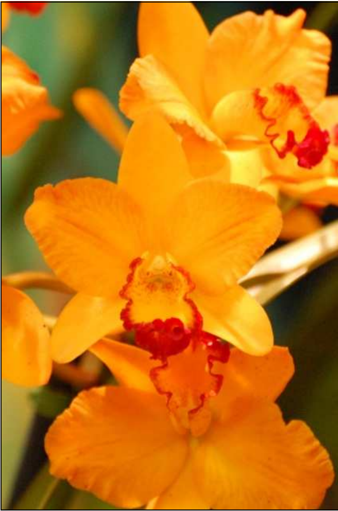
This gold/orange and red Cattleya hybrid was part of Sunset Valley Orchid's display at the Spring Show. Finding the name of this plant would have entailed entering the exhibit space on foot, so we didn't get it.