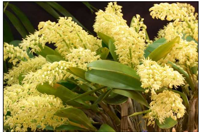
This Dendrobium speciosum tooks the Geer Trophy for Best Specimen, the Hadacheck Trophy for Best Dendrobium, and the Bliss Trophy for Best Species. It was grown by Tuyet's Orchids.