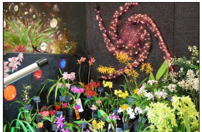
The Palomar Orchid Society had a fantastic illustration of the show theme, earning them the Balboa Trophy: spiral galaxy + orchids = 1 preposition away from "Galaxy of Orchids."