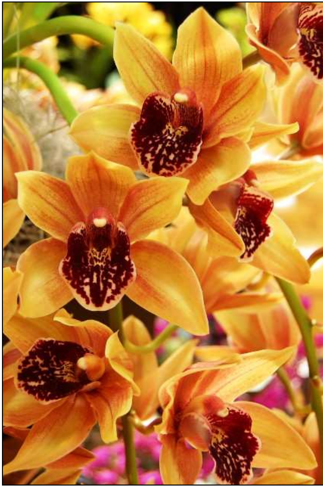
Cymbidium Bulbarrow 'Will Stately' AM/AOS, grown by Casa de las Orquideas was there to greet visitors right across from the entrance door to the exhibit hall at "Galaxy of Orchids," the 66th annual SDCOS Show.