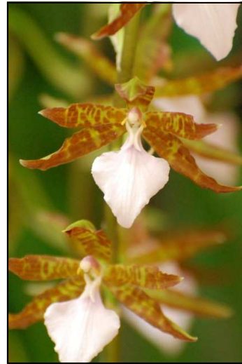
This Rhynchosstele (syn. Lemboglossum ) bictoniense took the Dugger Trophy for Best Species or Hybrid Odontoglossum and was grown by Asbell Orchids. This is one of the more terrestrial members of the genus and grows great outdoors in semi-shaded frost-free locations.