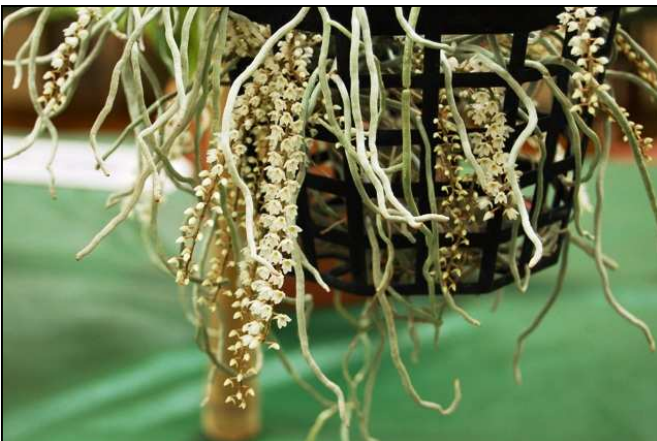
Microcoelia stoltzii took the Wilson Trophy for Most Unusual Orchid Flower and was grown by the San Diego Zoo. This is a great example of an aphyllous orchid that only grows roots and inflorescences.