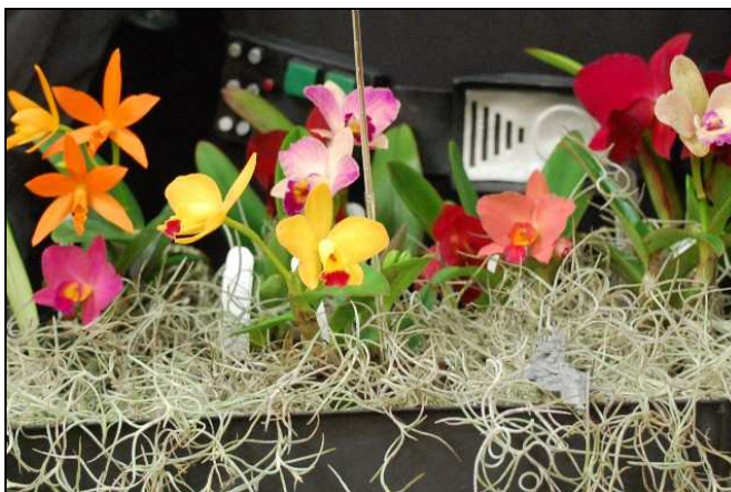
The Bishop Trophy for Best Miniature Cattleya Hybrid went to this Pot. Rubescence 'Svo' AM/AOS x Slc. Pink Doll 'Garnet Sea' Am/AOS (2nd from right), and was exhibited by the SDCOS on this mini-Catt buffet table (without sneezeguard).