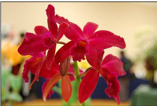
This Slc. Spirit of '76 'Cherry Wine' HCC/AOS represented 1/3rd of the Pacific Trophy for the Best 3 Cattleyas in Containers. Sunset Valley Orchids (Fred Clarke) grew this one.