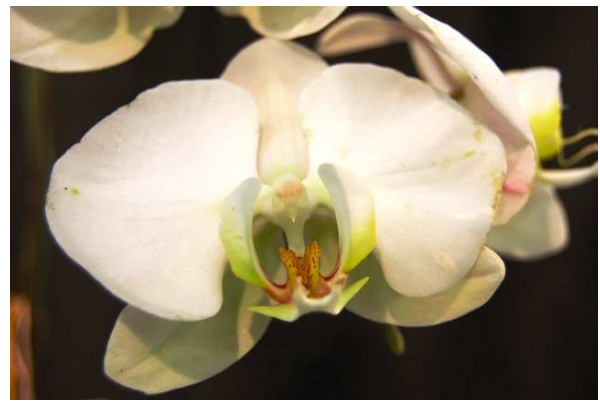
Nico's Phal. Sogo Yukidan took 1st Place and Best of Section 8(A) for these rectangular white flowers with green centers.