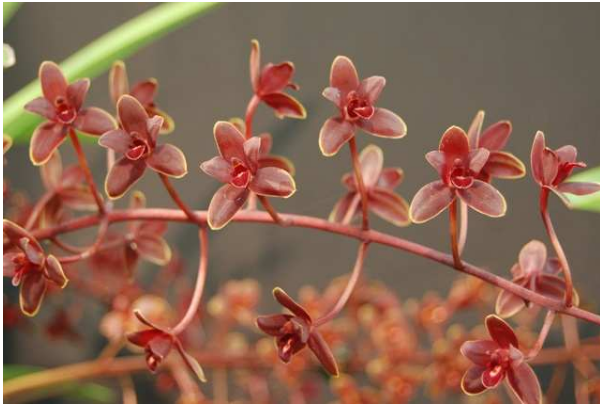
Once again Edith and Leno Galvan's Cym. Little Black Sambo 'Black Magic' took 1st Place and Best of Section 2(B).