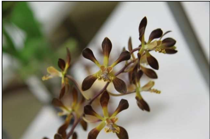
Encyclia alata ssp. parviflora AM/AOS Exhibited by Tom Osborne Awarded AM/AOS 83 points