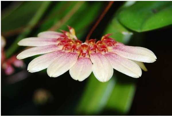
Nico Goossens's Cirrhopetalum makoyanum took 1st Place and Best of Section 12 (ii) for this floriferous warm grower.