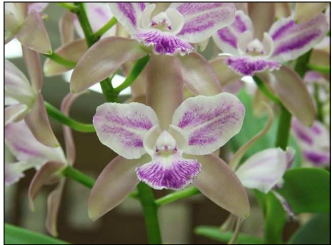
Lc. San Diego Variable 'Solana Beach' AM/AOS Exhibited by Billy Baker Awarded AM/AOS 82 points

There were five orchids presented for judging. Two awards were given.