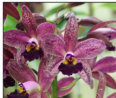
Blc. San Diego Spice 'Tall 'N Spicy' AM/AOS