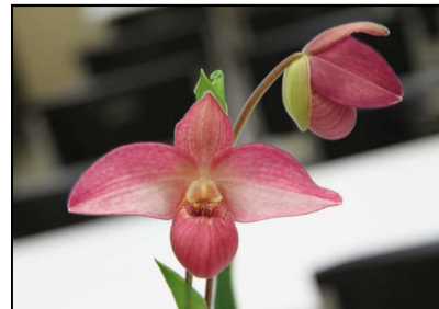
Phrag. Sue Omeis 'La Jolla' HCC/AOS

There were 10 orchids presented for judging. Five awards were given, with two awards to one plant.