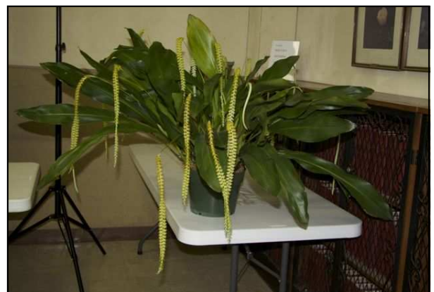
Dendrochilum magnum FCC/AOS

Exhibited by Arnie Gum Awarded FCC/AOS 92 points