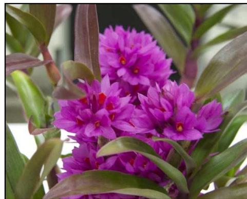
Den. Hibiki 'Sandra's Delight' FCC/AOS