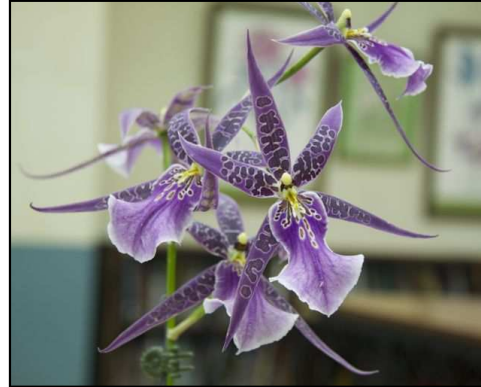
Mtssa. Azetc 'Uschi' HCC/AOS

There were 3 orchids awarded, including 2 FCC's: