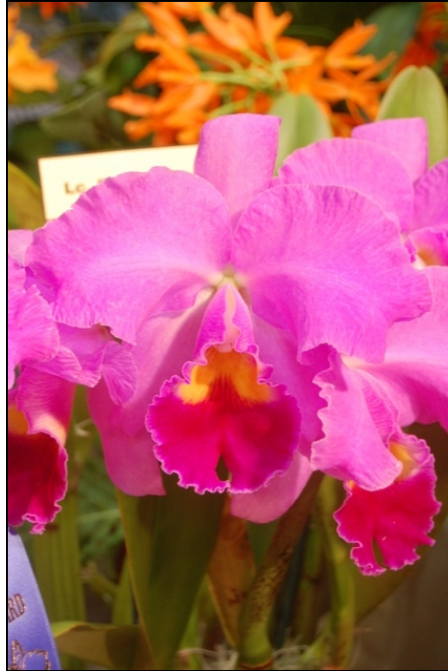
Rex Foster Orchids took the Canale Trophy for best colored Cattleya hybrid for this Lc. Drumbeat. This was a gorgeous flower, but how'd they pull it off without the "B" in the Lc.?