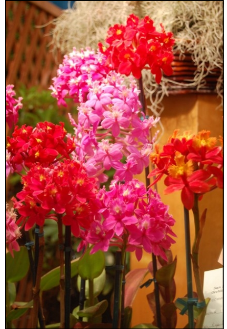
Epidendrum Pacific Whimsey, pictured here among other large-flowered reed-stems brought by Cal-Orchid, took the DeMaria Trophy for best Reed Stemmed Epidendrum.