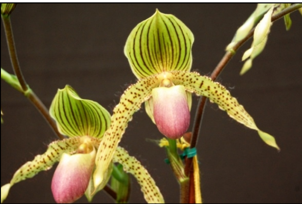
Orchid Source brought in this Paph. Prime Child, which was awarded 1st Place/Best of Section 7.