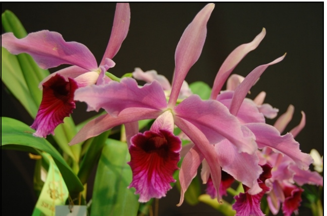
Phyllis Prestia's Laelia Pacavia 'Ace' (a 1 0 hybrid) earned 1st Place and Best of Section 4.