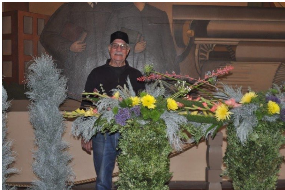
San Diego Floral Association Centennial Flower Show 2015 Photo