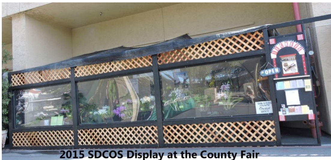
2015 SDCOS Display at the County Fair