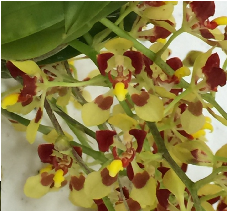
Gomesa colorata 'Jojo's Fire Cracker' HCC/AOS Exhibited by Andy's Orchids Awarded HCC, 78 points

There were 7 orchids presented for judging. Two were awarded: