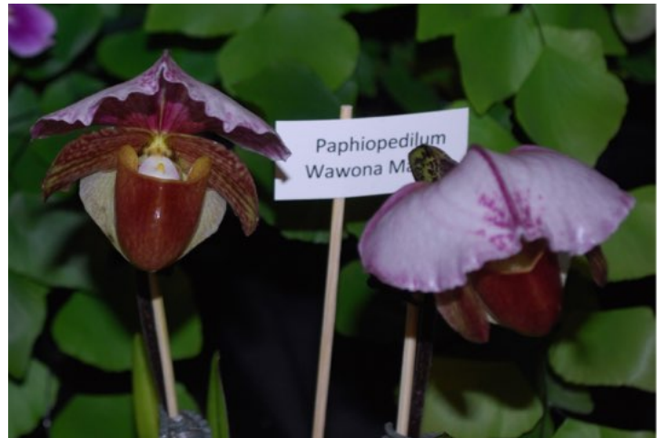
Photos from the Huntington Show