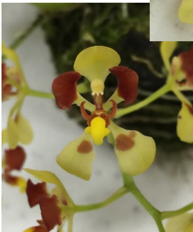
Gomesa colorata 'Jenny' AM/AOS Exhibited by Andy's Orchids Awarded AM, 80 points