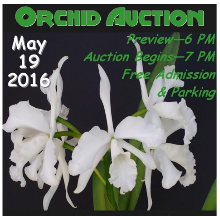
San Gabriel Valley Orchid Hobbyists Los Angeles County Arboretum & Botanic Garden 301 North Baldwin Avenue Arcadia, CA 91066

Only two pests are commonly associated with reed stem Epis: hard brown scale and aphids. The former can sometimes appear,