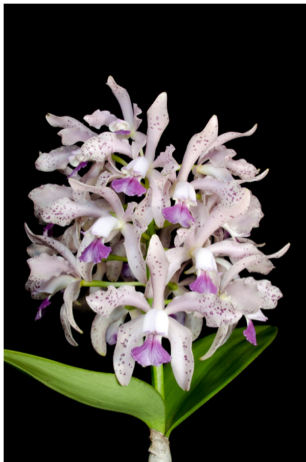
Cattleya Leoloddiglossa 'SVO Speckled Blue' FCC/AOS 90 pts. (C. Loddiglossa x C. tigrina) - Fred Clarke