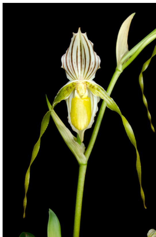
Paphiopedilum Temptation 'Seagraves' AM/ AOS 80 pts. (Paph. kolopakingii x Paph. philippinense) - John Hagee