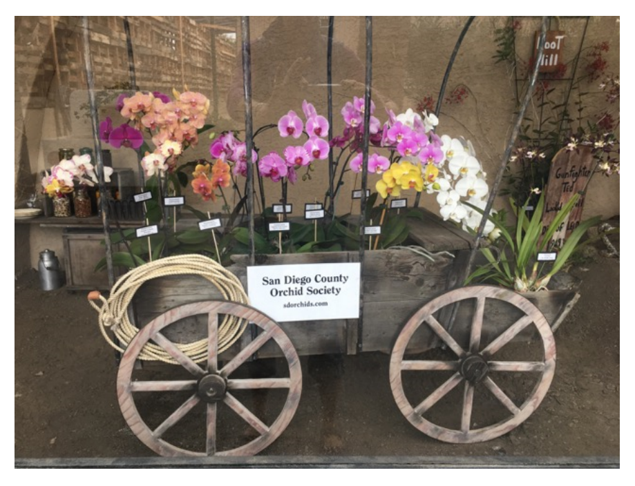
continued on page 6

Several of our members are also having fun entering the Orchid Container Floral Ribbon competition inside the O'Brien building which is located on the East side of the building near the roll up doors. This competition is rewarding members with cash for their ribbons, so take a look to see who will be able to make new additions to their orchid collections or greenhouse facilities after the fair is over! There is a new competition each week, for a total of five competitions during the fair which runs thru July 4th, so there will be new orchids on display each week. It's a