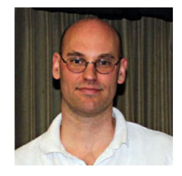
continued on page 2

Here is an introduction in his own words. "Although I teach middle school kids for a living, one of my passions has always been plants. I began growing orchids as an offshoot from working at Longwood