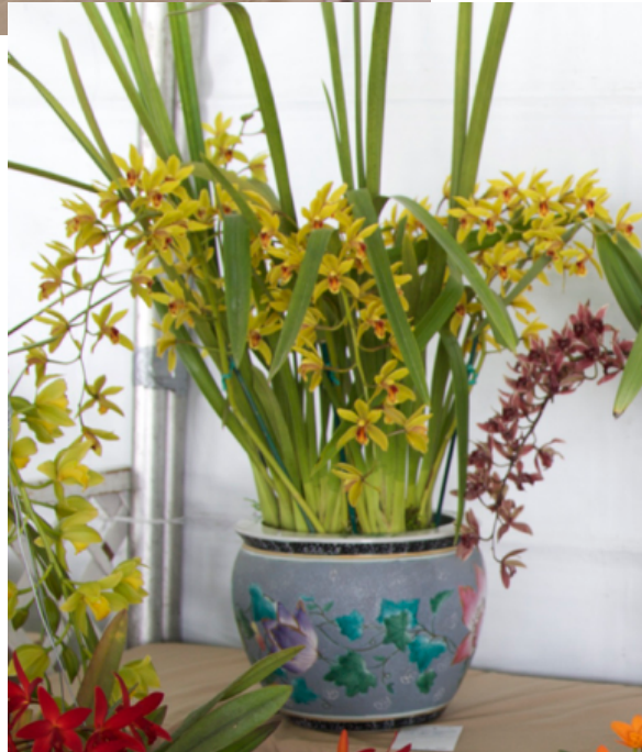
Cym. Pat Ann