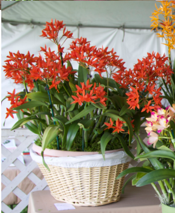
Catt. Blazing Treat