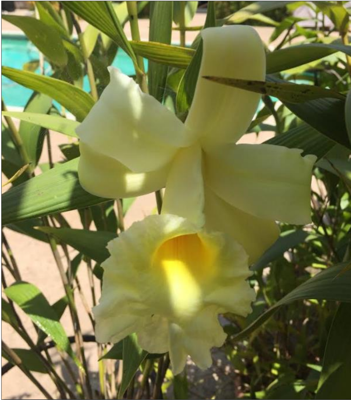
Sobralia Veitchii Plant and photo by Betty Kelepecz