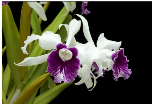
Laelia purpurata 'Schusteriana'