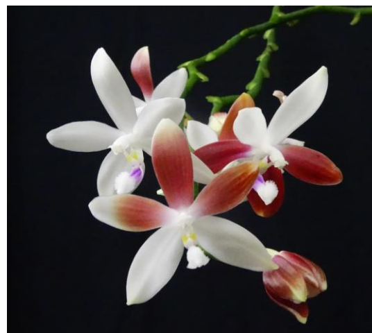
Phal. tetraspsis f. christiana 'C#1' Plant and photo by Dan Forbes