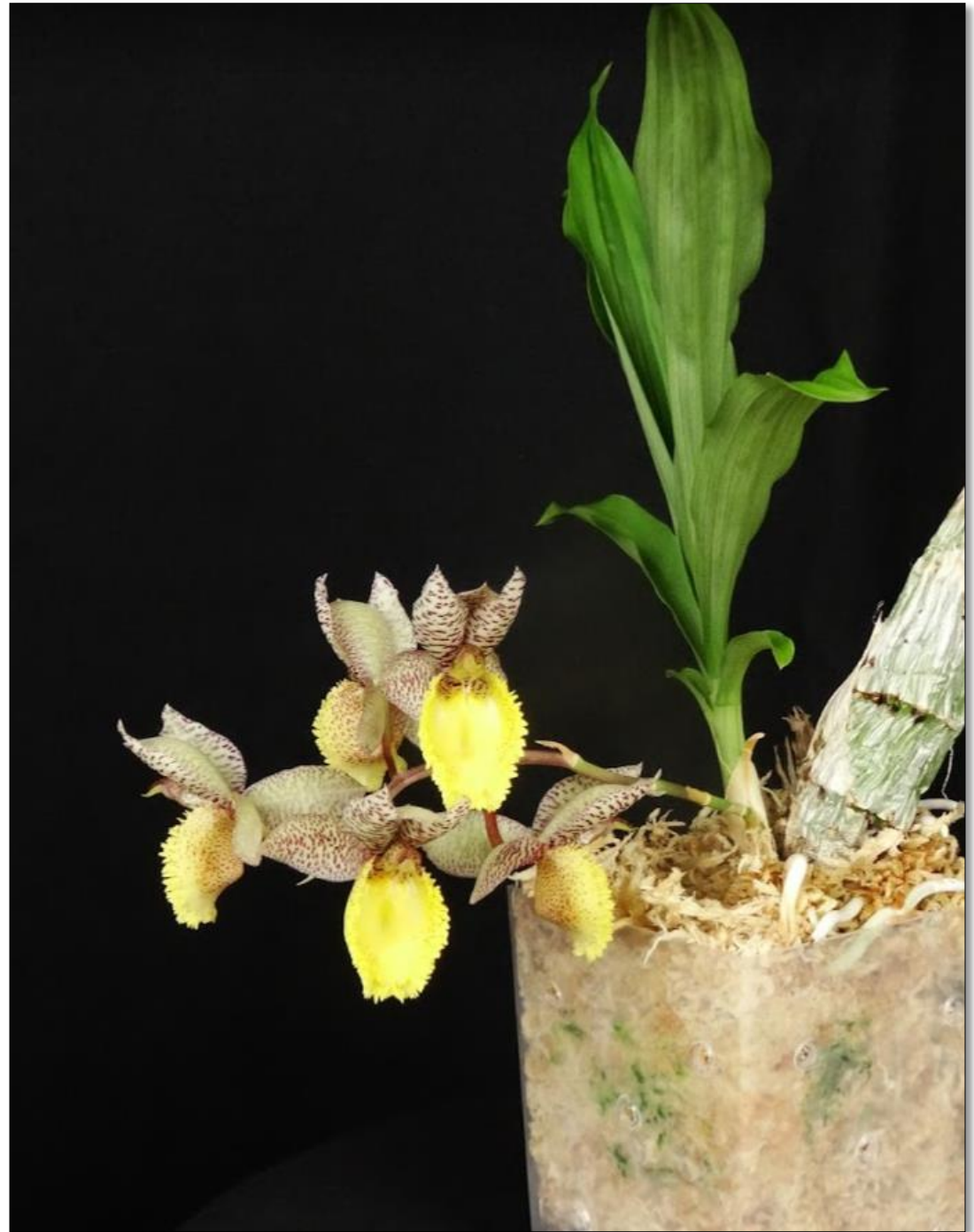
Ctsm. Chuck Taylor 'Wow' x Ctsm. denticulatum 'SVO II' AM/AOS Plant and photo by Dan Forbes